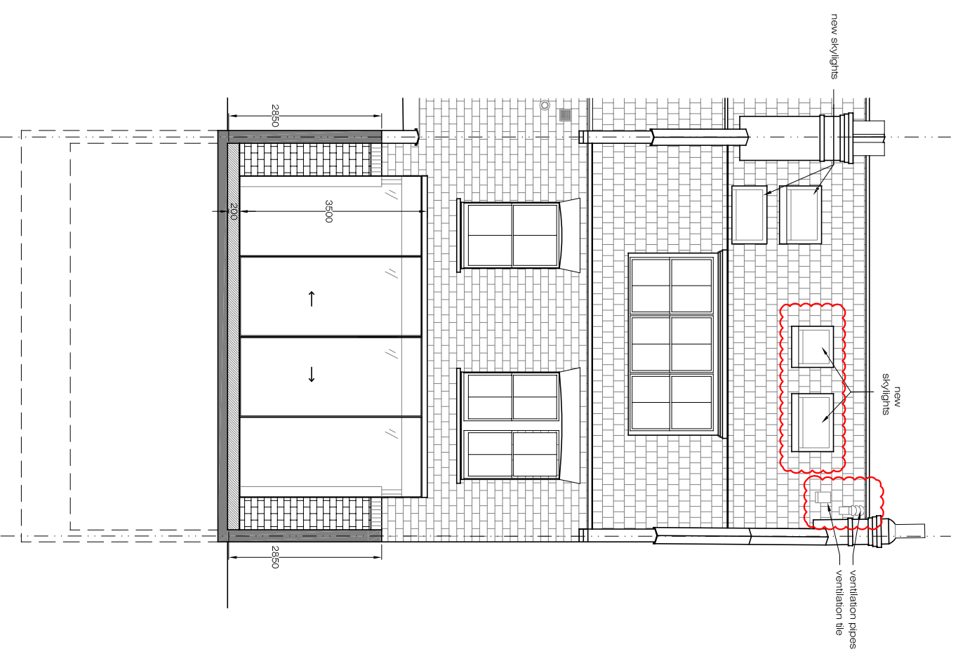
PROPOSED Rear Elevation SCALE 1/100@A3 PA-04