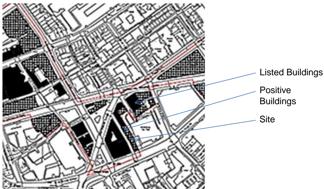
Fig 5 Extract from LBoC CAA Sub Area 8 (Not to scale)

Fig 5 shows the extent of above-ground heritage assets in the immediate area. The site, at least the front onto Grape Street, is noted as a 'positive' building in this analysis but it is not designated