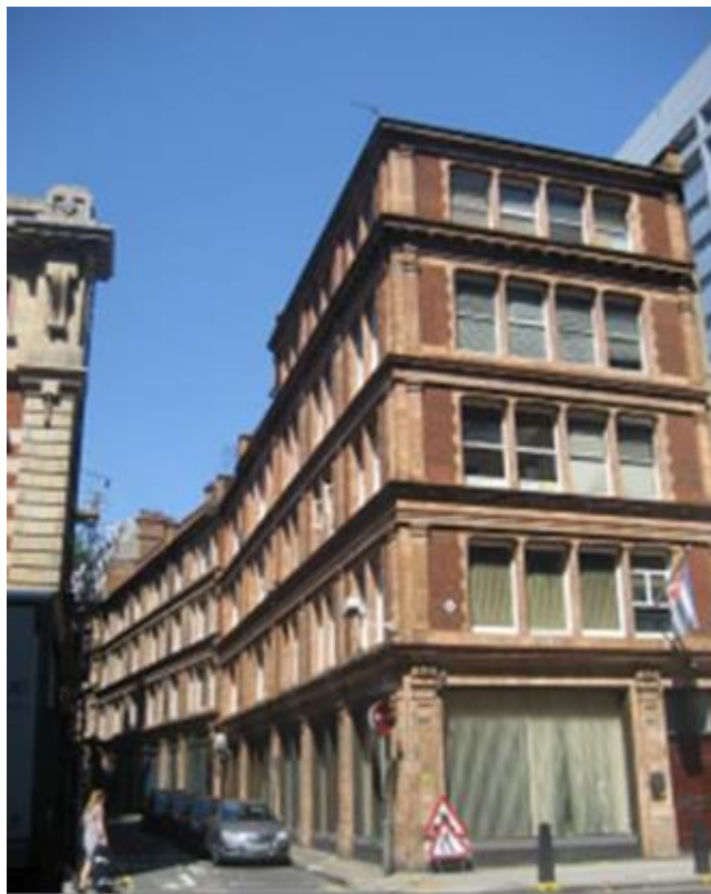
Fig 7 View looking north from Holborn; 15-17 Grape Street in the foreground

It is concluded that the subtle changes and additions being proposed in this planning application constitute enhancement, adding richness to one of the buildings in the enclave. In so doing, it enhances the character and appearance of Sub Area 8 and the setting of the neighbouring Grade II listed assets.