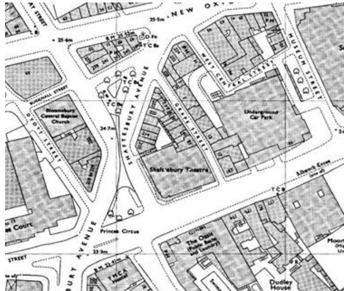
Fig 4 OS 1968-1973 (Not to scale)

By 1910 the frontage to Broad Street had been redeveloped, opening up (now) Grape Street from the south and the pub to the sedt appears to have been reused for another purpose. Not Holborn Baths replacing older, smaller properties on the south side of Broad Street. (See Fig 3)