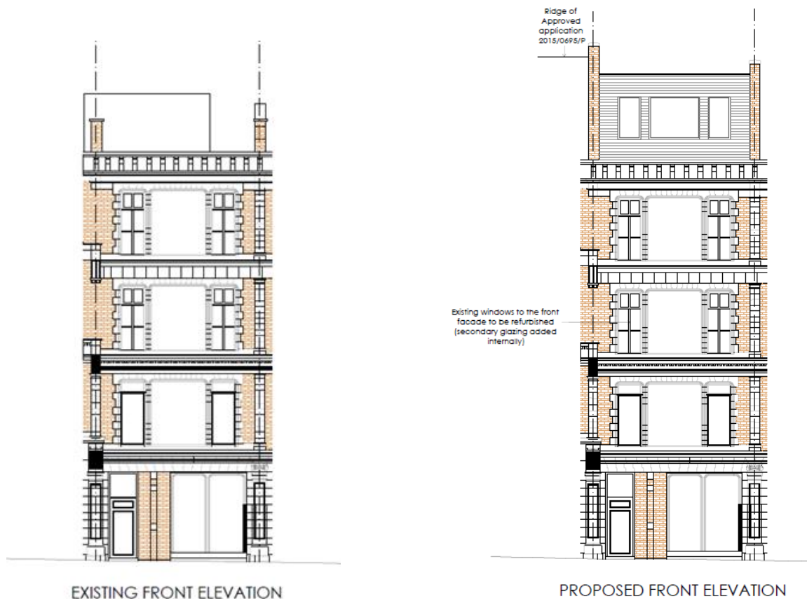
Fig 6 Existing and Proposed front elevations (HK Architects 2015)

(Please refer to planning application submission plans HK Architects 2015))