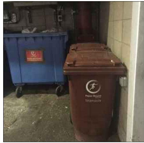
2. food waste