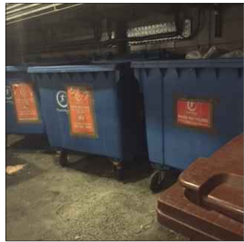
1. plastic, paper, mixed waste