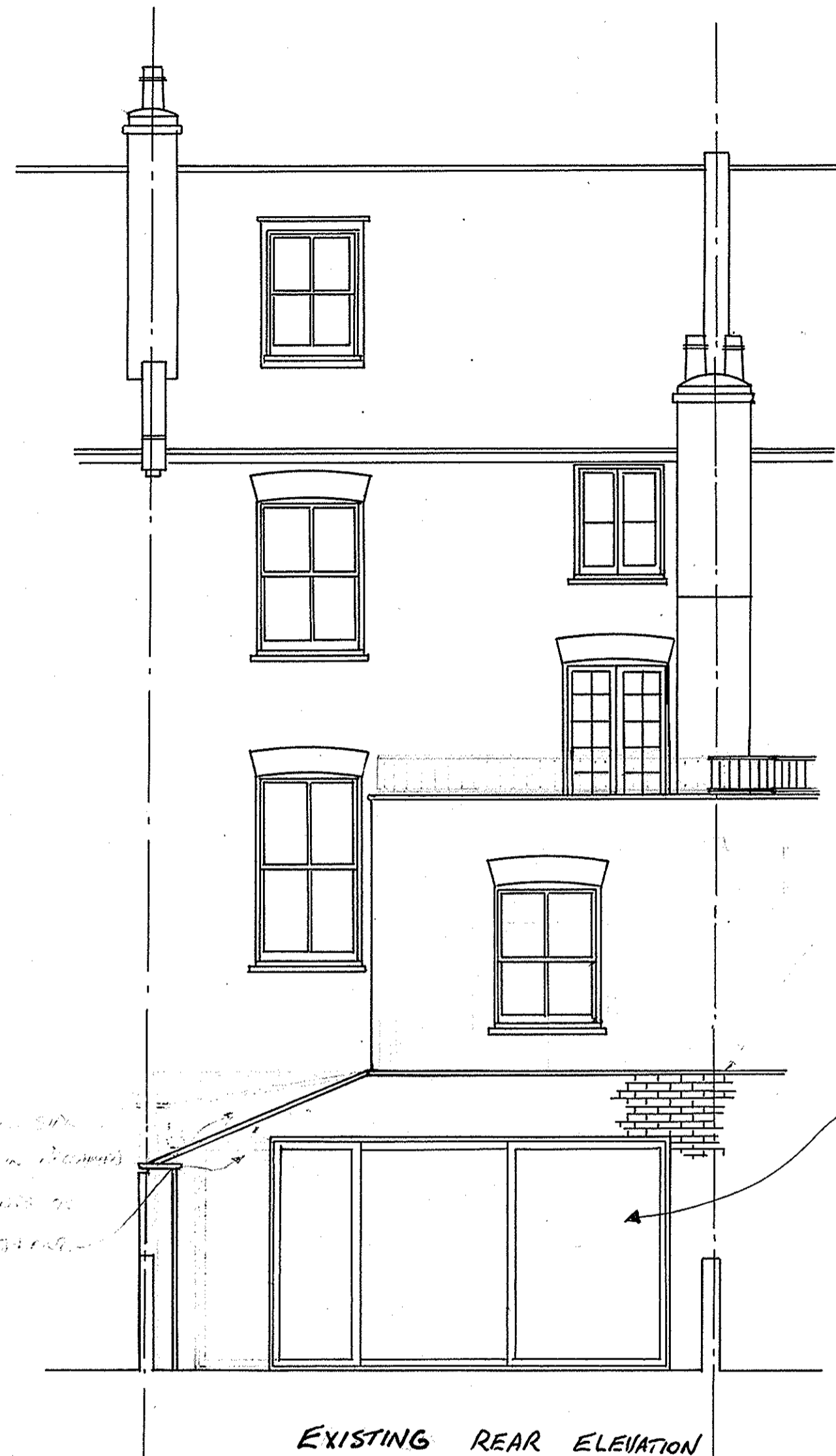
EXISTING REAR ELEVATION 1:50

DOUBLE GLAZED UNITS TO SIDE EXTENSION ROOF.