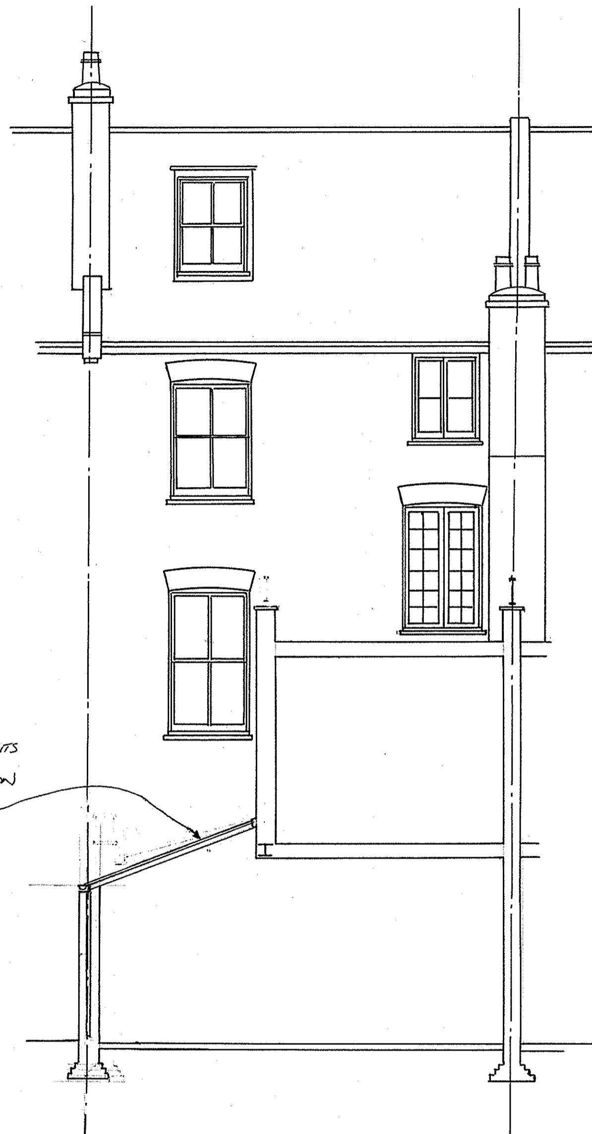
EXISTING SECTION B-B 1:50

DOUBLE GLAZED UNITS TO SIDE EXTENSION ROOF.