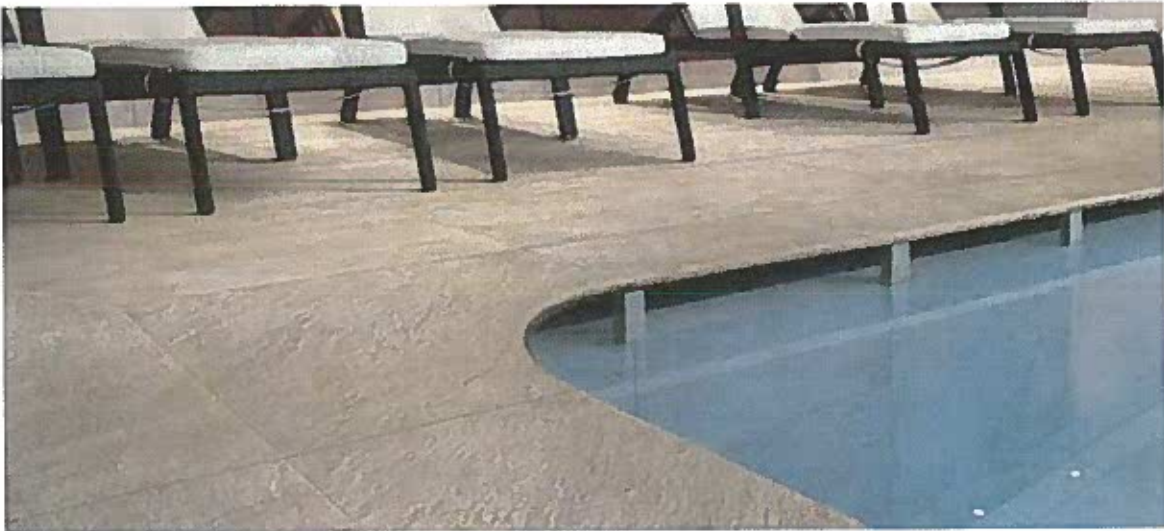
Weatherproof and lightweight 20 mm thick and load bearing Porcelain tiles for outdoor use