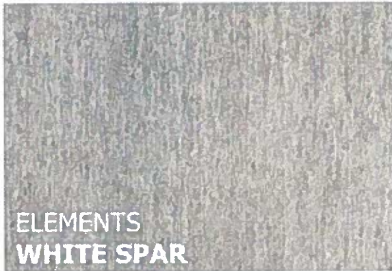
ELEMENTS WHITE SPAR