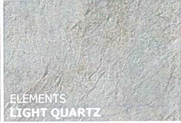
ELEMENTS LIGHT QUARTZ