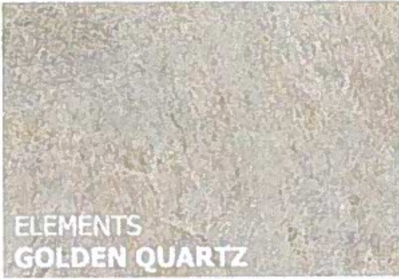
ELEMENTS GOLDEN QUARTZ