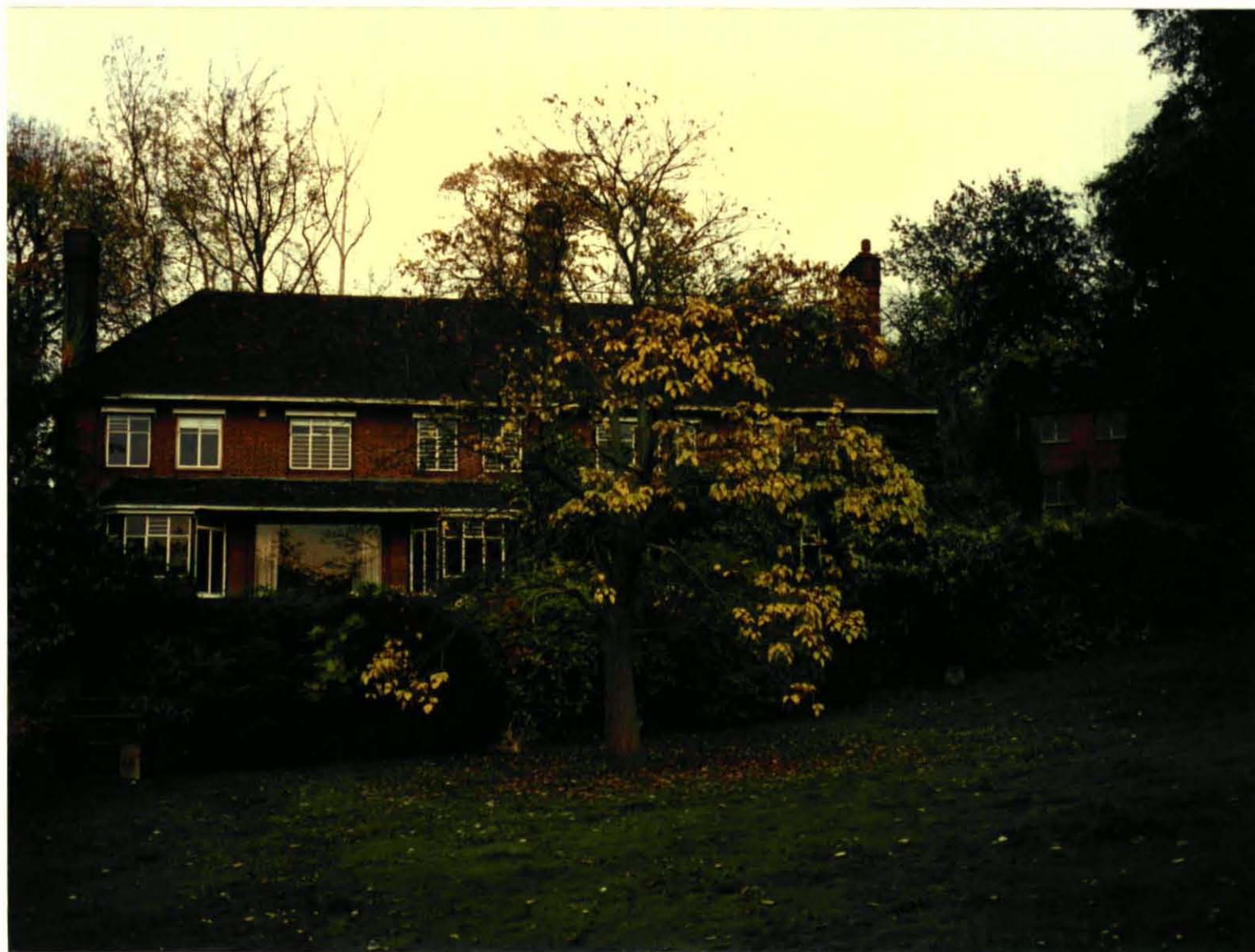
HEATHFIELD PARK MERTON LANE LONDON N6 GENERAL VIEW FROM THE SOUTH-WEST