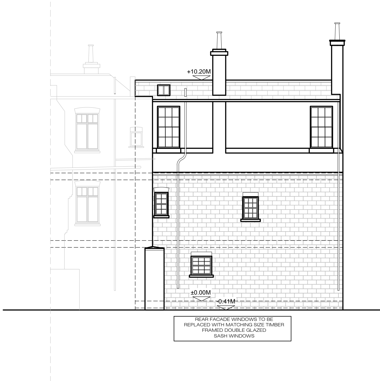
08 A-(14)-010 PROPOSED REAR ELEVATION 1:50 @ A1, 1:100 @ A3