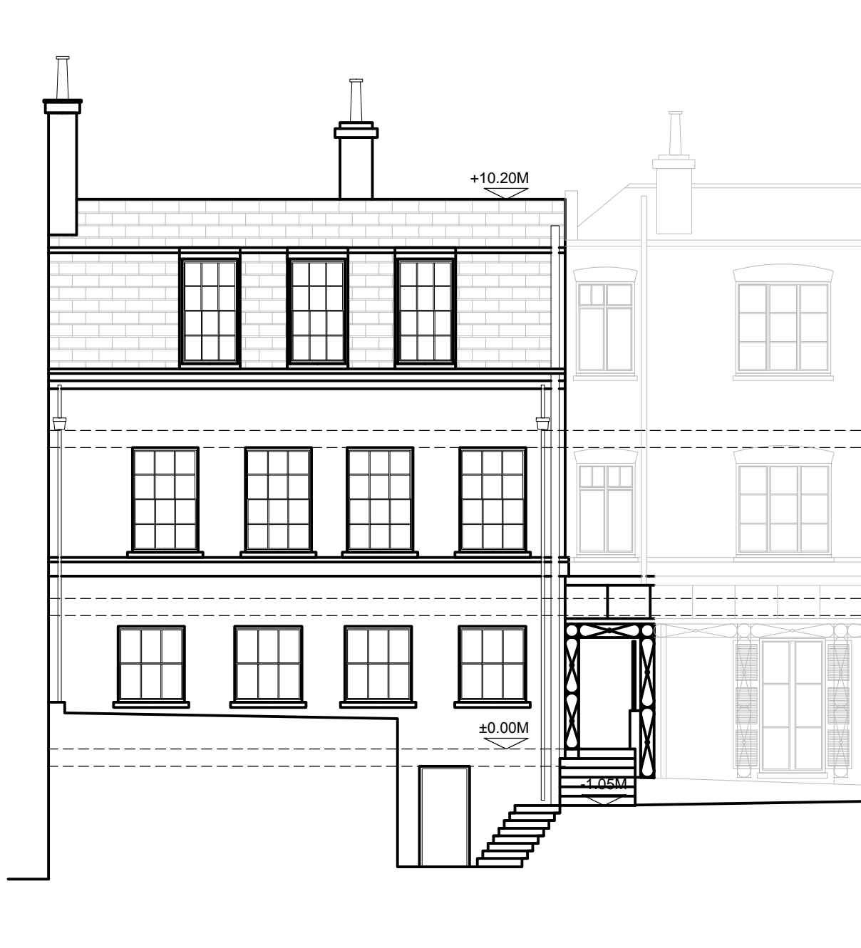
07 A-(14)-010 PROPOSED FRONT ELEVATION 1:50 @ A1, 1:100 @ A3