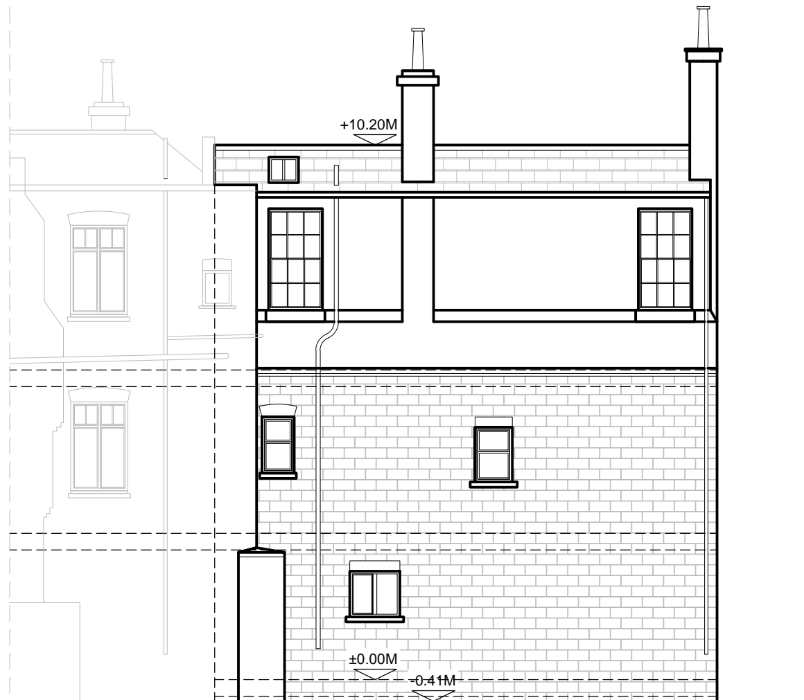
03 EXISTING FRONT ELEVATION A-(11)-010 1:50 @ A1, 1:100 @ A3