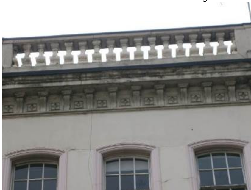
Front Elevation – Second Floor & First Floor – flaking decoration & cement render