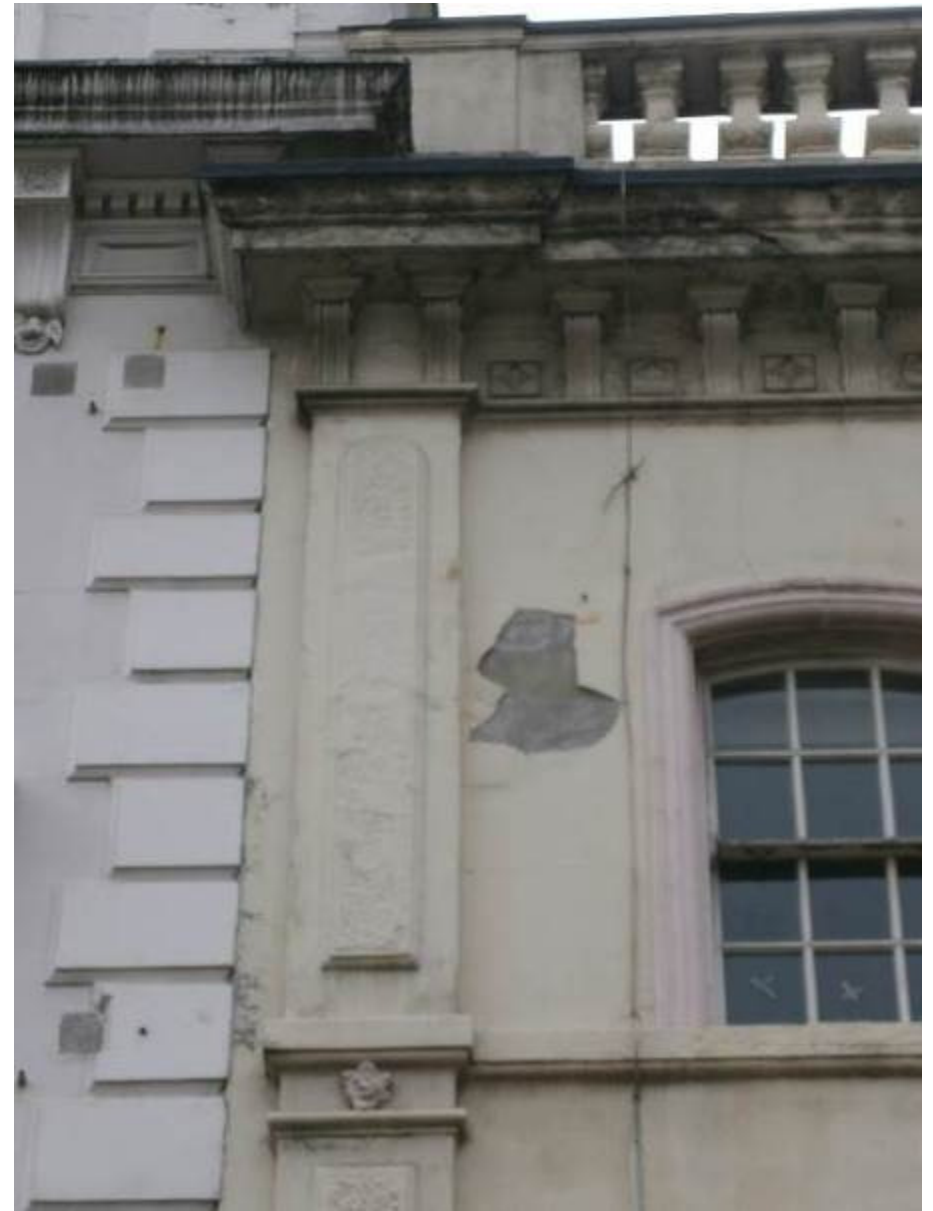
Front Elevation – Second Floor left hand side – flaking decoration & cement render