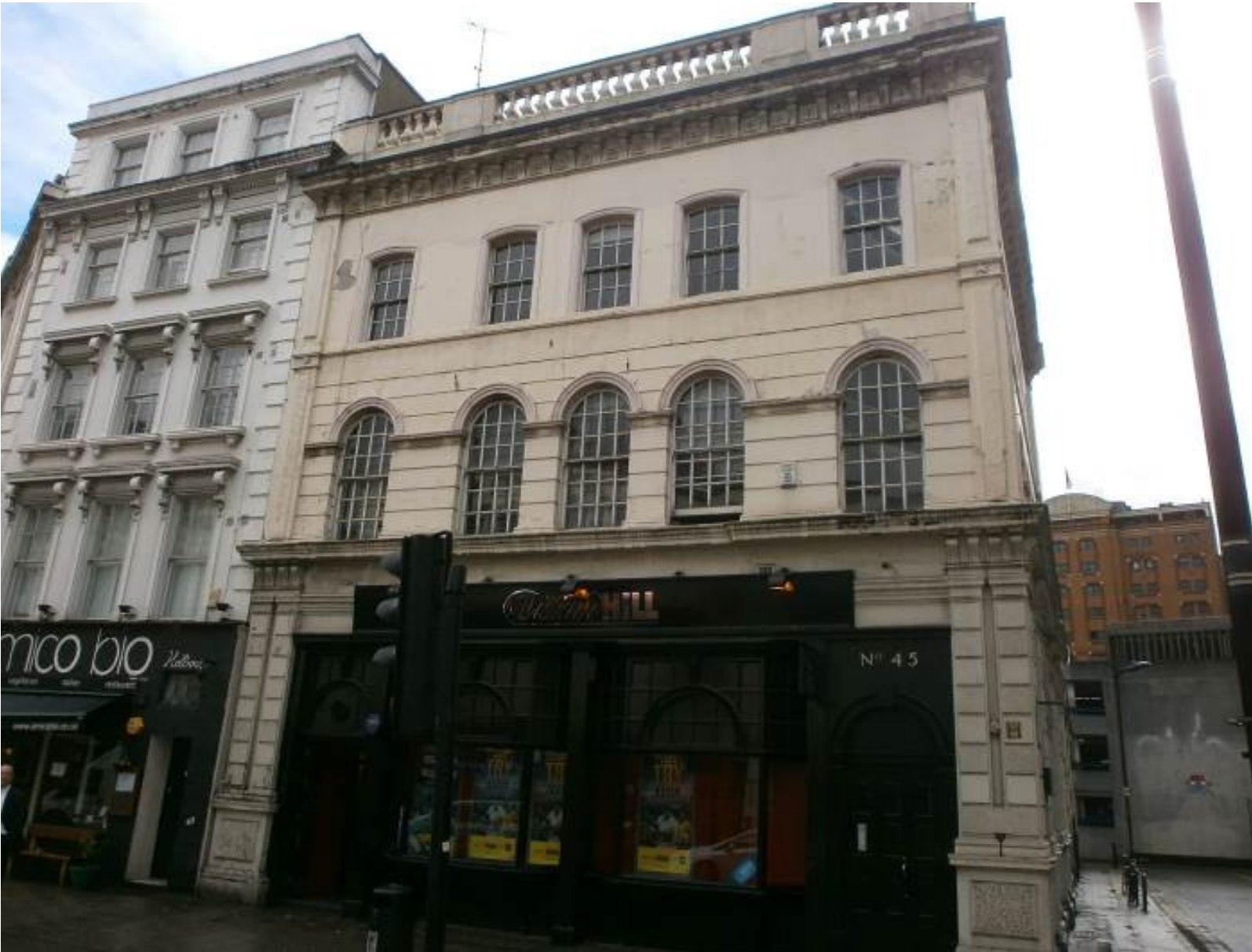
Front Elevation (New Oxford Street)