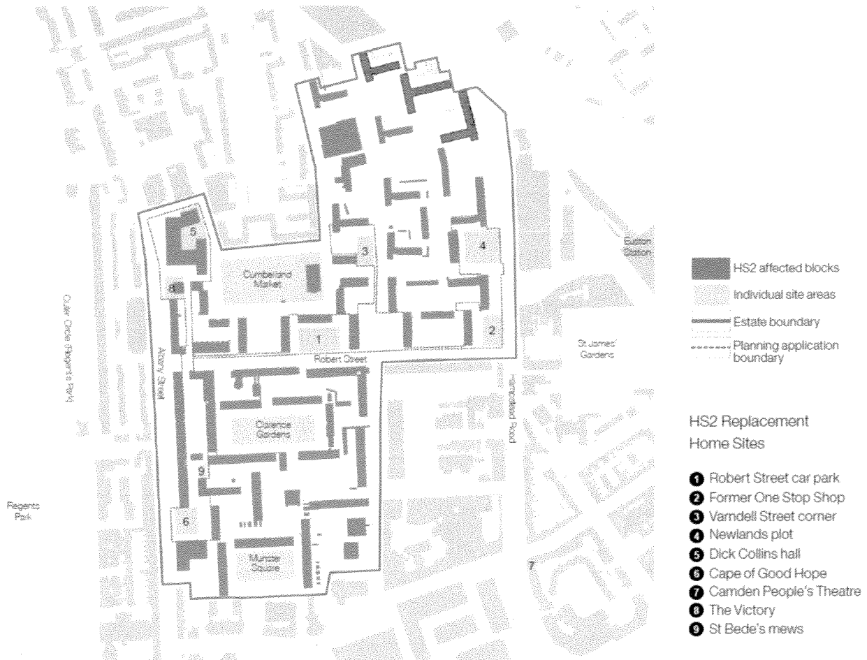
Figure 3: Regent's Park Estate - Proposed development sites

12 This proposal also includes provision for an additional 22 homes to provide an amount of resilience into the replacement homes programme, and flexibility in the future to meet changes in household composition and/or any increase in demand. Thus a total of 116 homes are proposed.