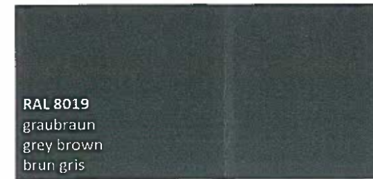
04 RAL 8019 - Window and Balustrade Colour