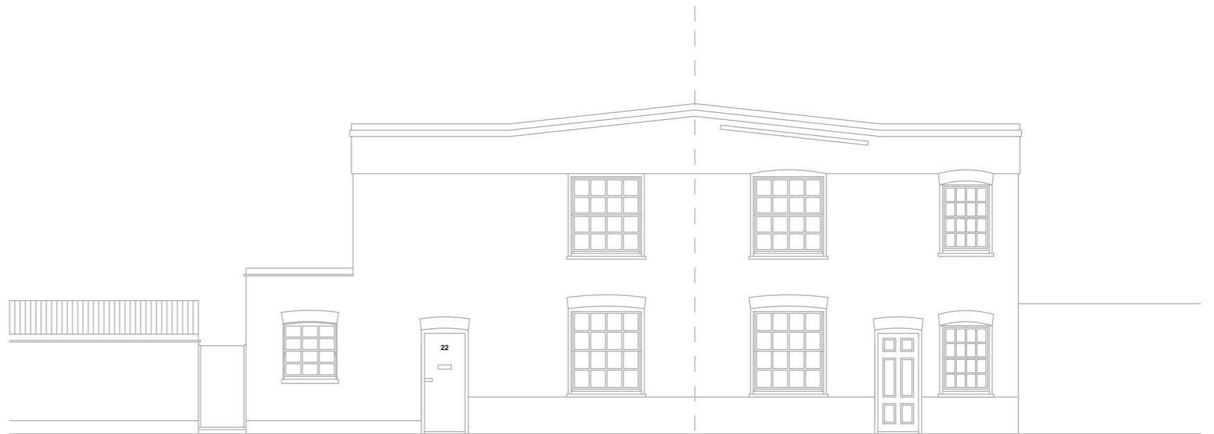
22 FORTESS GROVE EXISTING FRONT ELEVATION