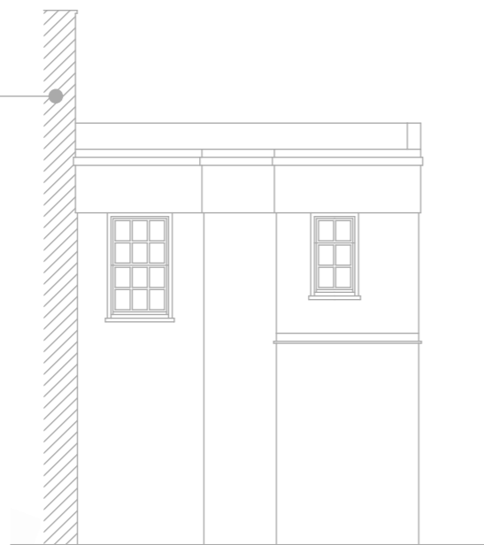
22 FORTESS GROVE EXISTING SIDE ELEVATION