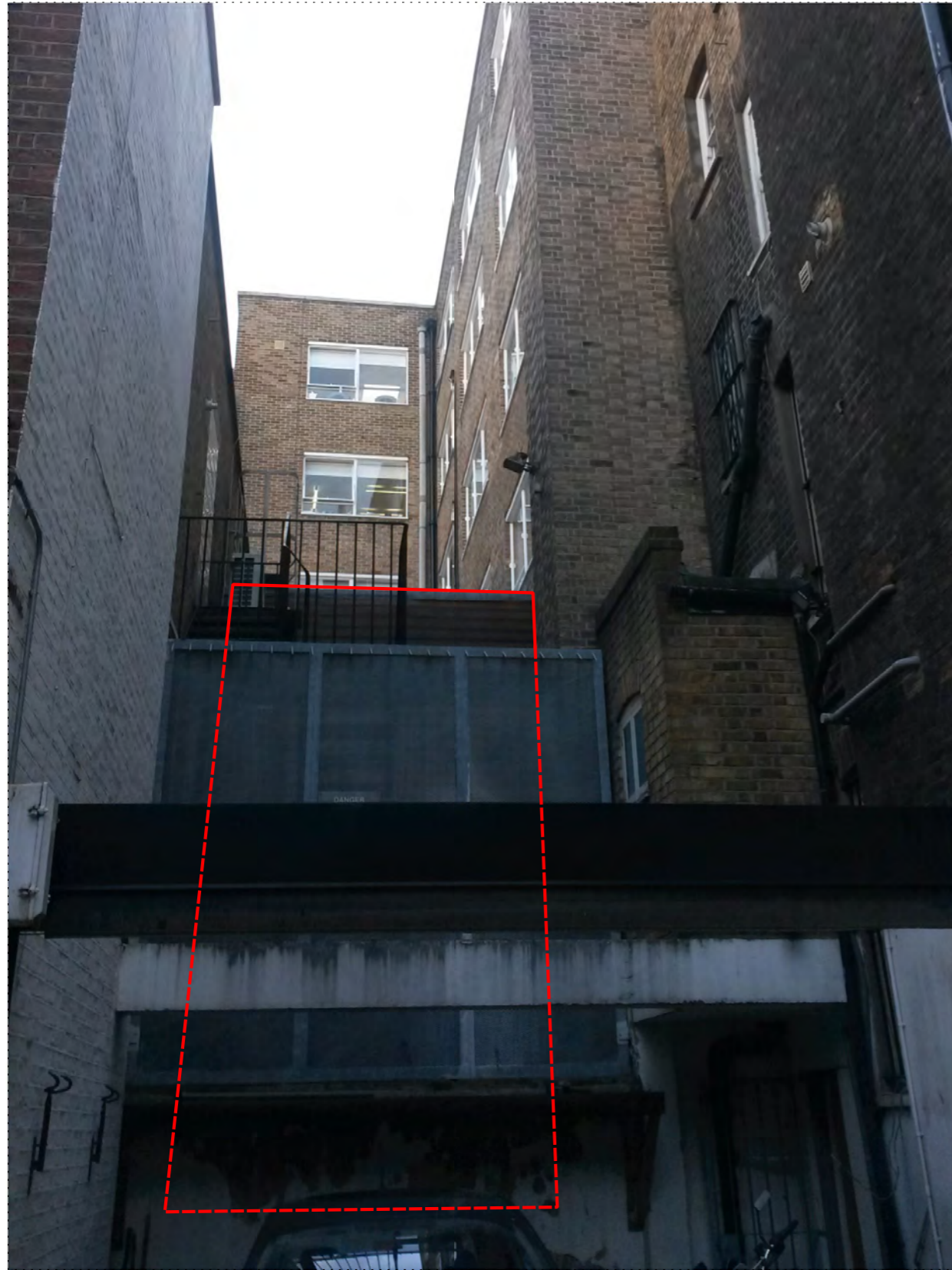
EXISTING SITUATION FROM CHARLOTTE MEWS (APPROXIMATE OUTLINE STAIRCASE IN RED)