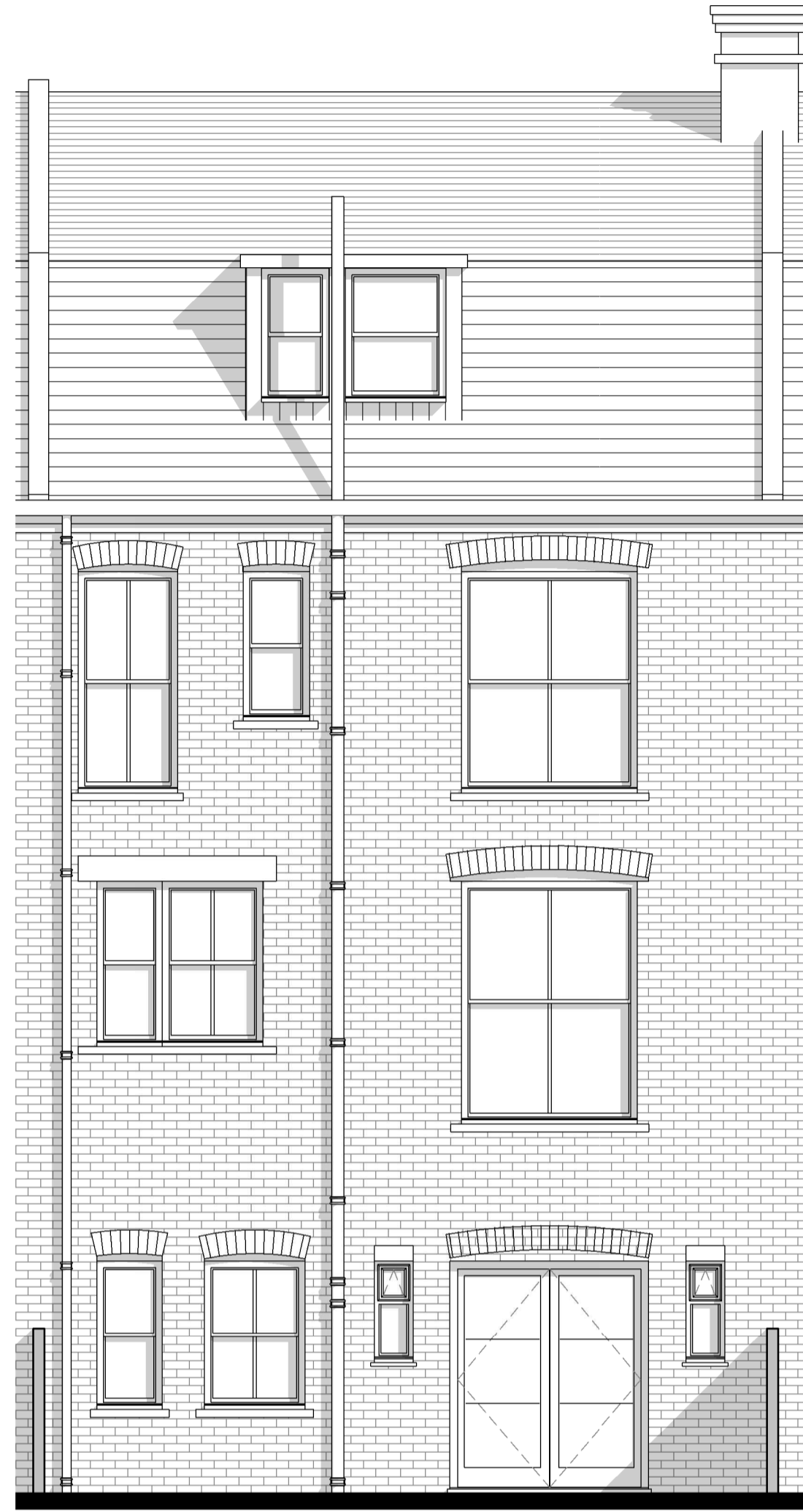
4 EXISTING REAR ELEVATION 1 : 50