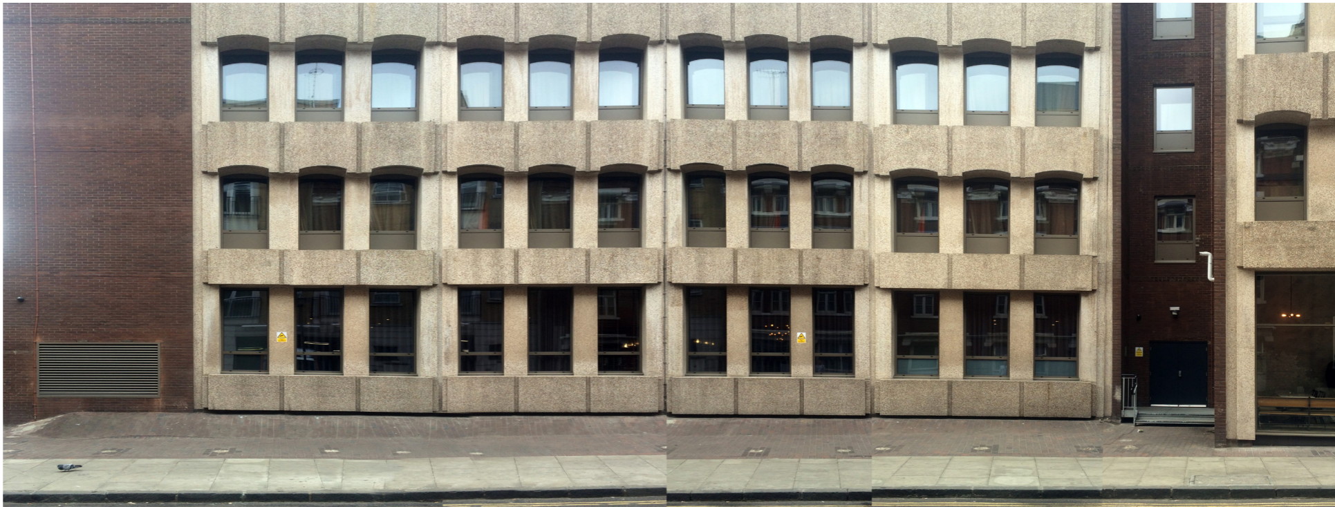
View of site.