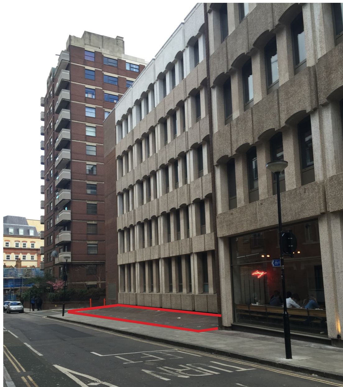
Site outlined in red.