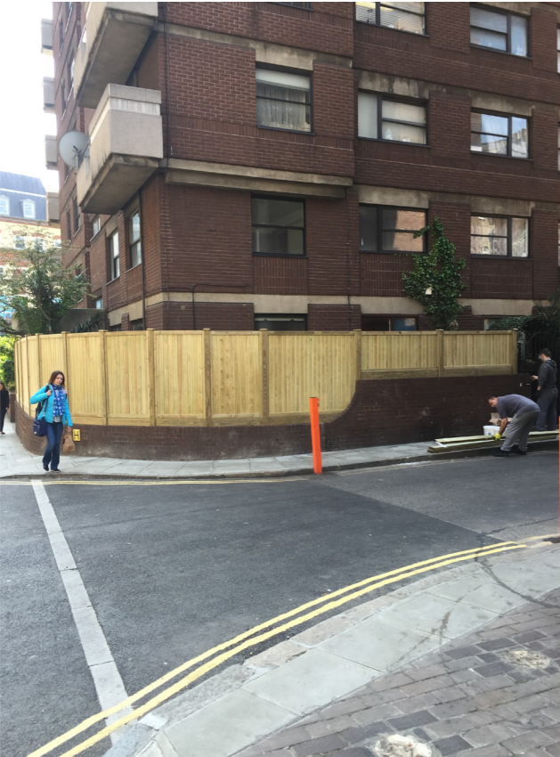
View of building adjacent.