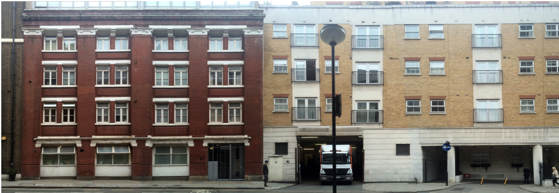
View of buildings directly opposite