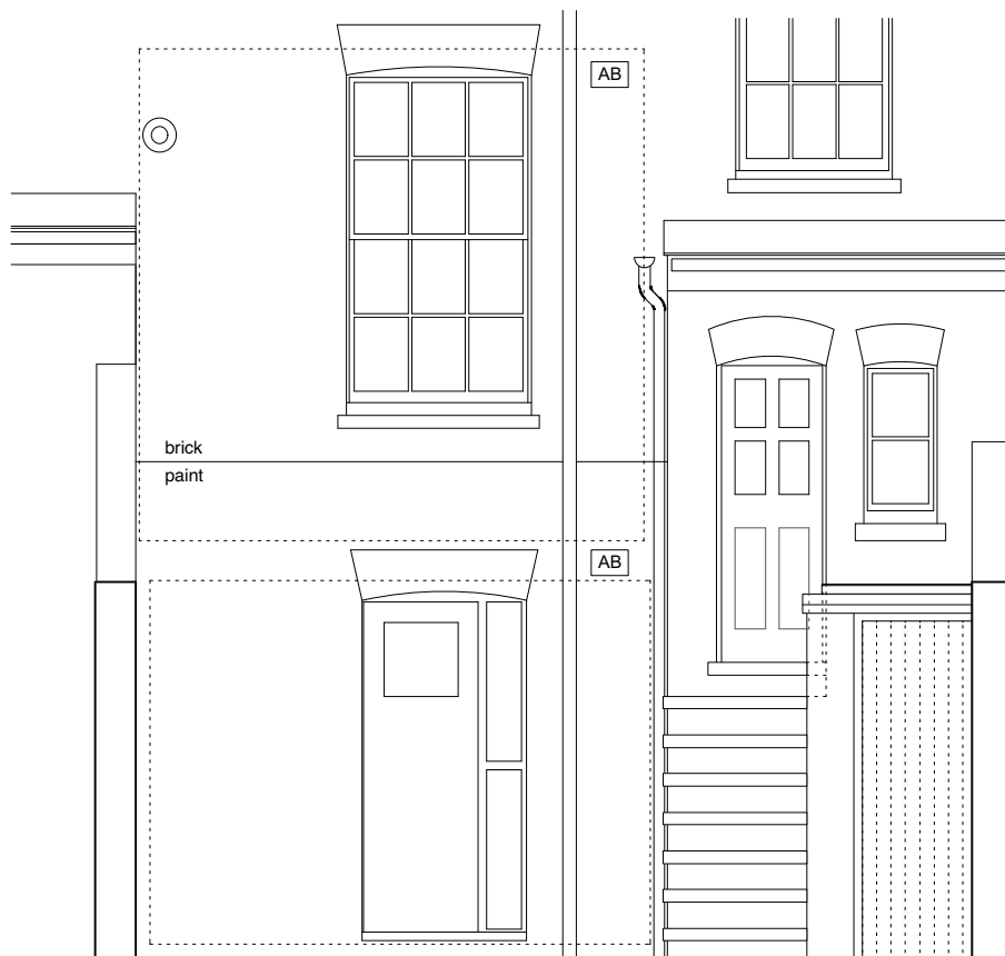
REAR ELEVATION (RAILINGS/BALUSTRADING OMITTED FOR CLARITY)