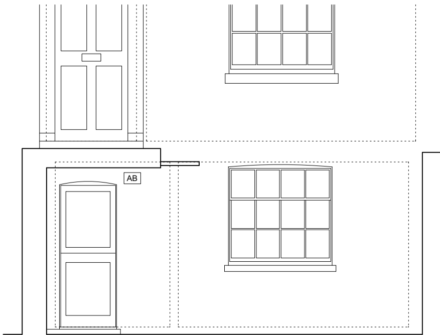
EXISTING FRONT AREA ARRANGEMENT (RAILINGS/BALUSTRADING OMITTED FOR CLARITY)