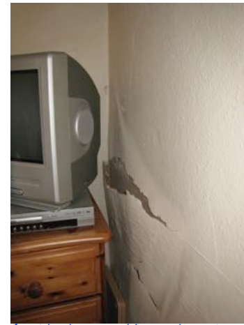
front bedroom - chimney breast corner