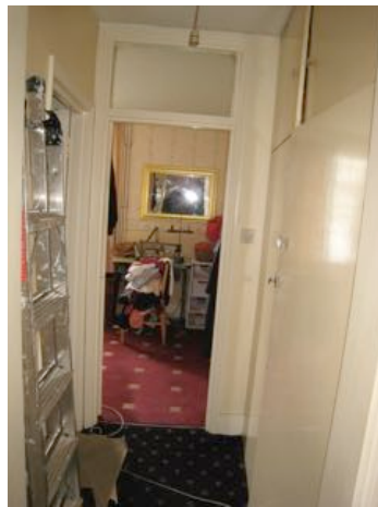
hall - view towards front bedroom