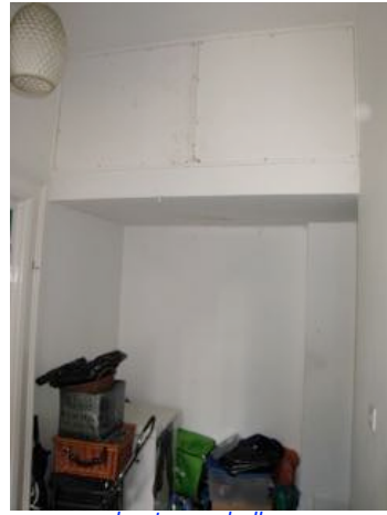
communal entrance hall