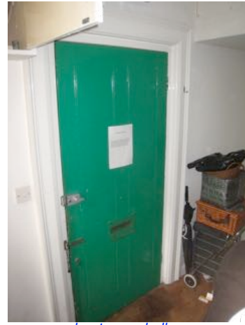
communal entrance hall