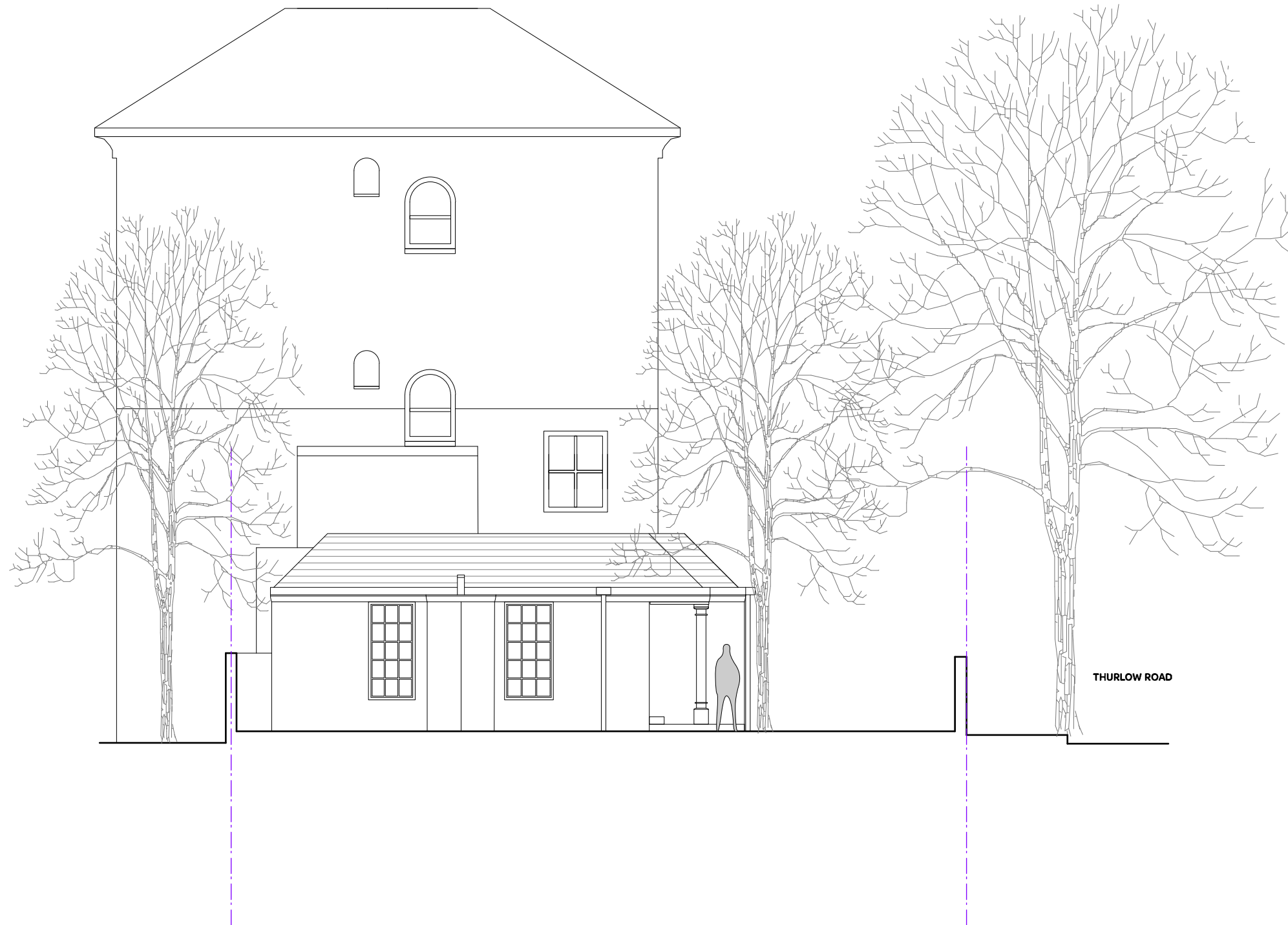
EXISTING NORTHEAST ELEVATION