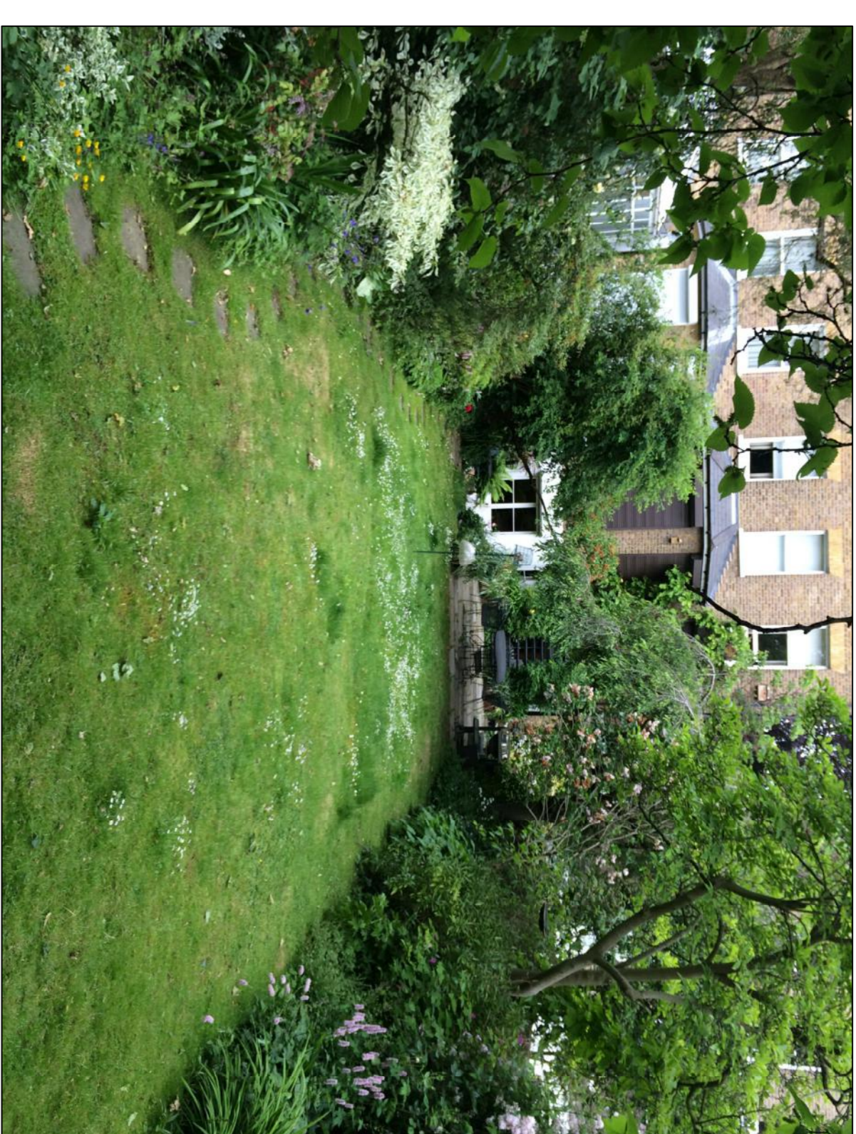
EXISTING SITE PHOTOGRAPH - Garden towards Rear Facade PHP-01