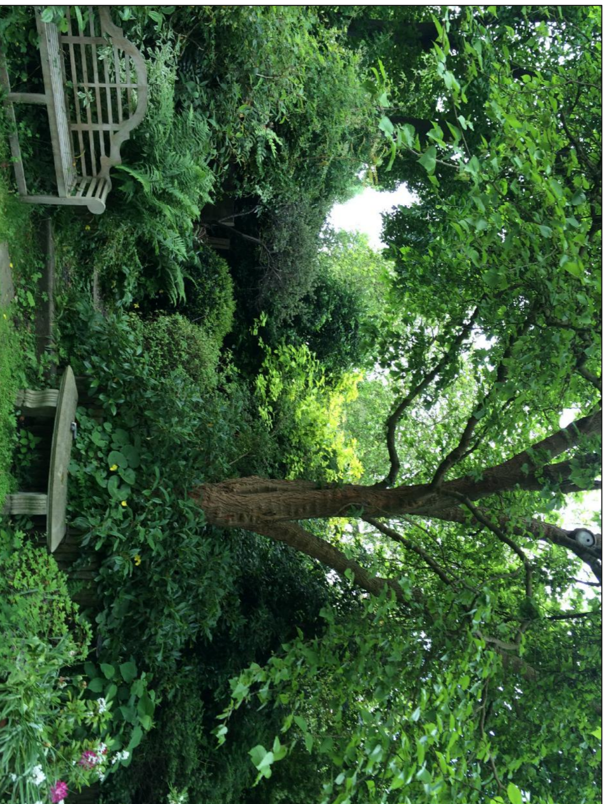
EXISTING SITE PHOTOGRAPH - Tree T1 PHP-01