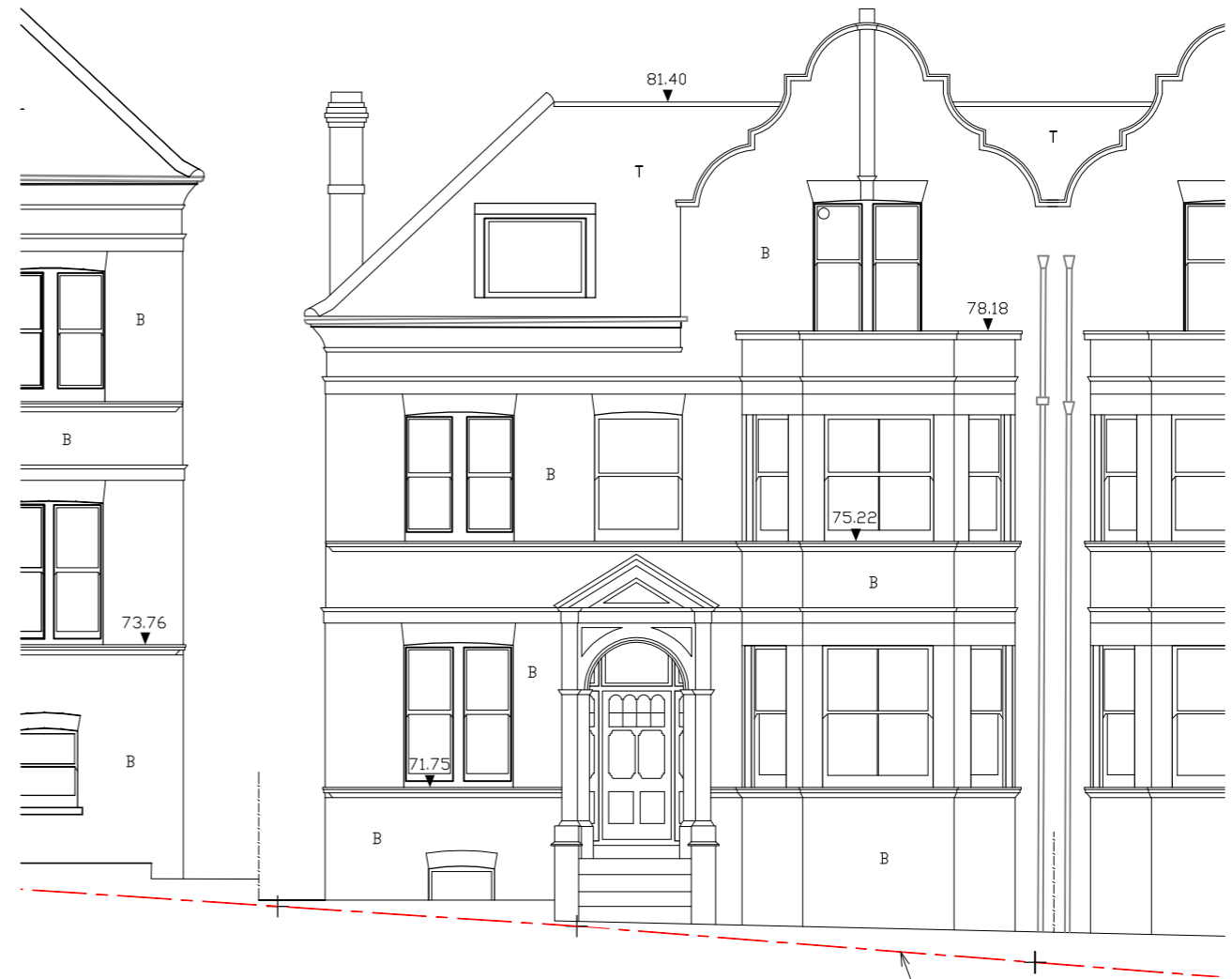
2 EXISTING FRONT ELEVATION 1 : 100