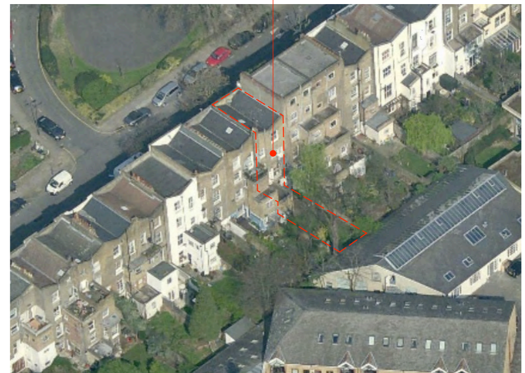
Bird's eye view from South.