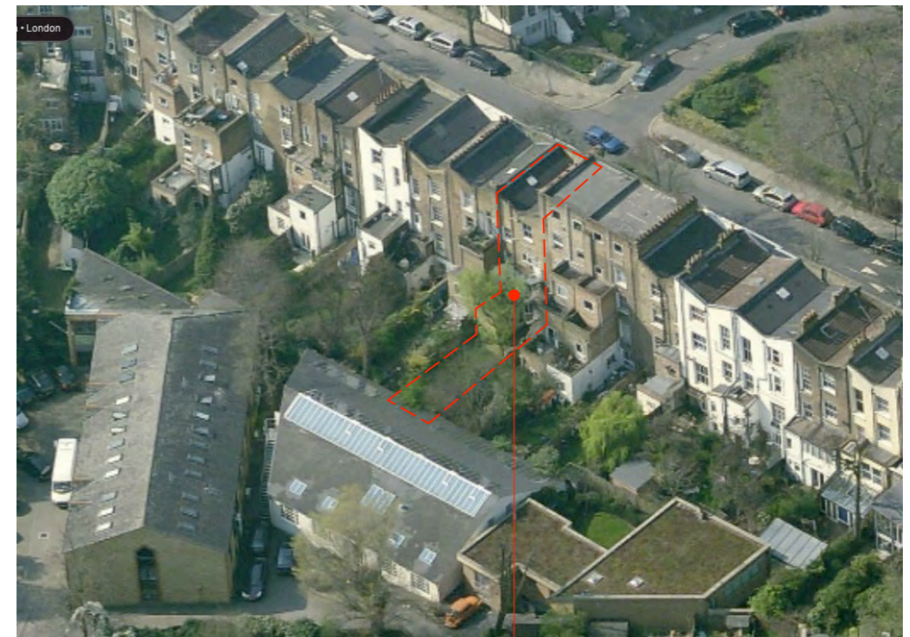
Bird's eye view from North.