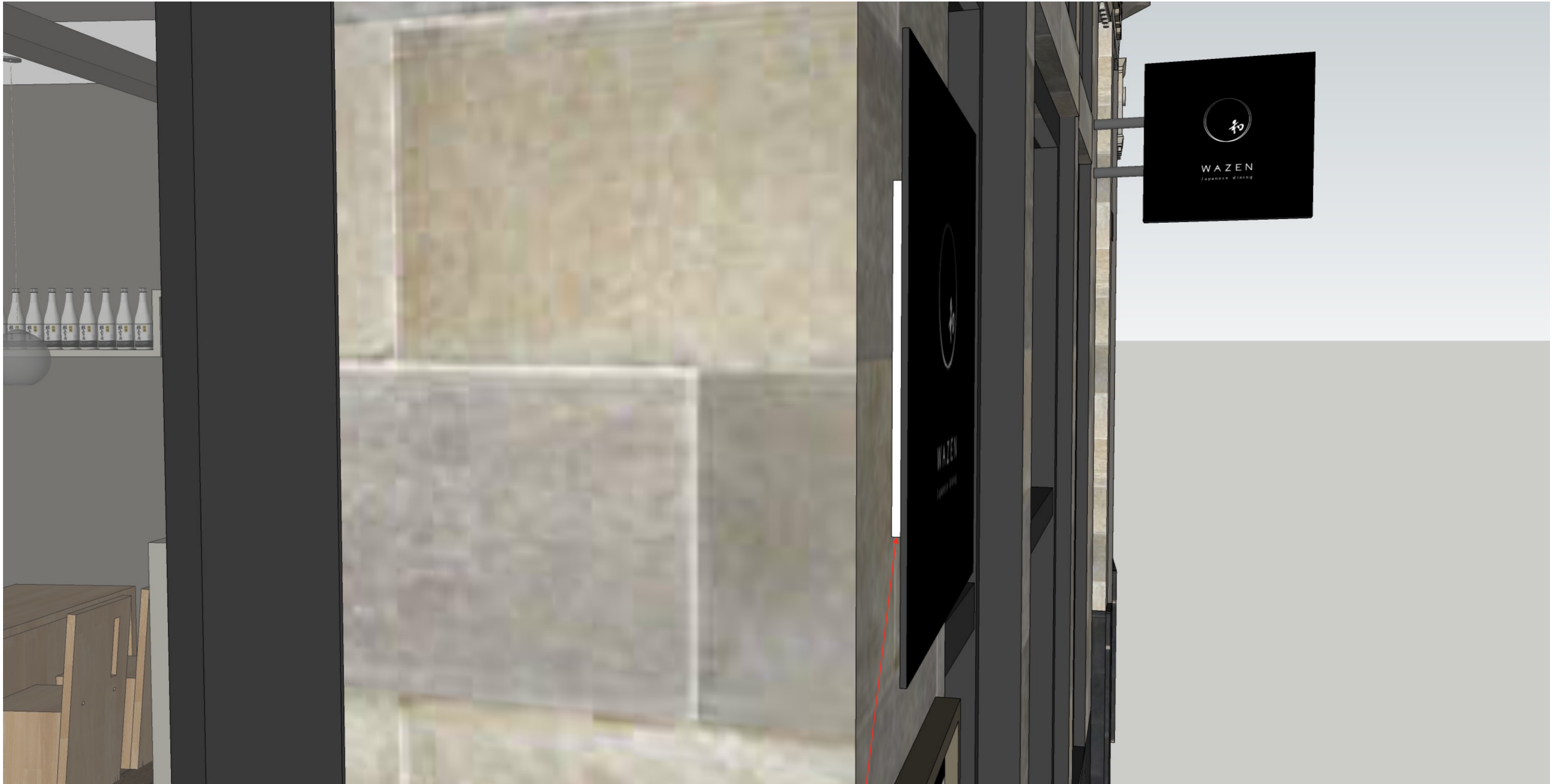
LED Light box illuminating main entrance signage