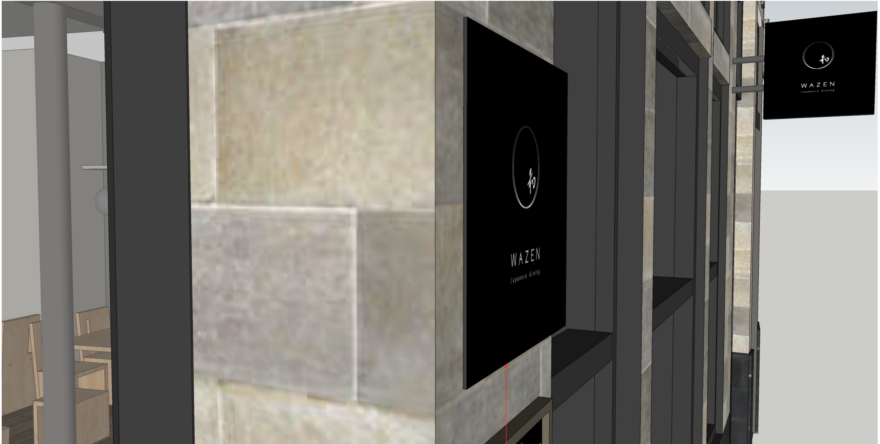
Main Entrance Fascia Sign 360mmx360mmx12mm made of black acrylic panel illuminated by the 35mm thick lightbox attached to the back of the panel and bolted to the entrance column.