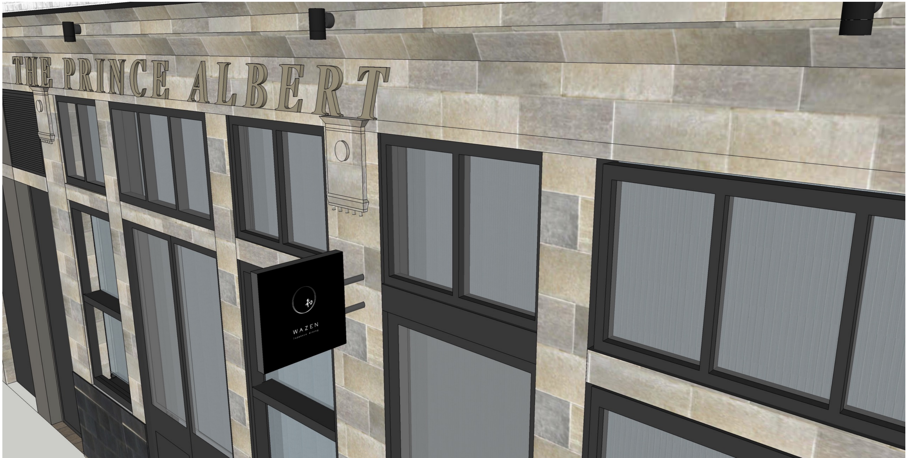
Proposed side signage on Acton Street facade