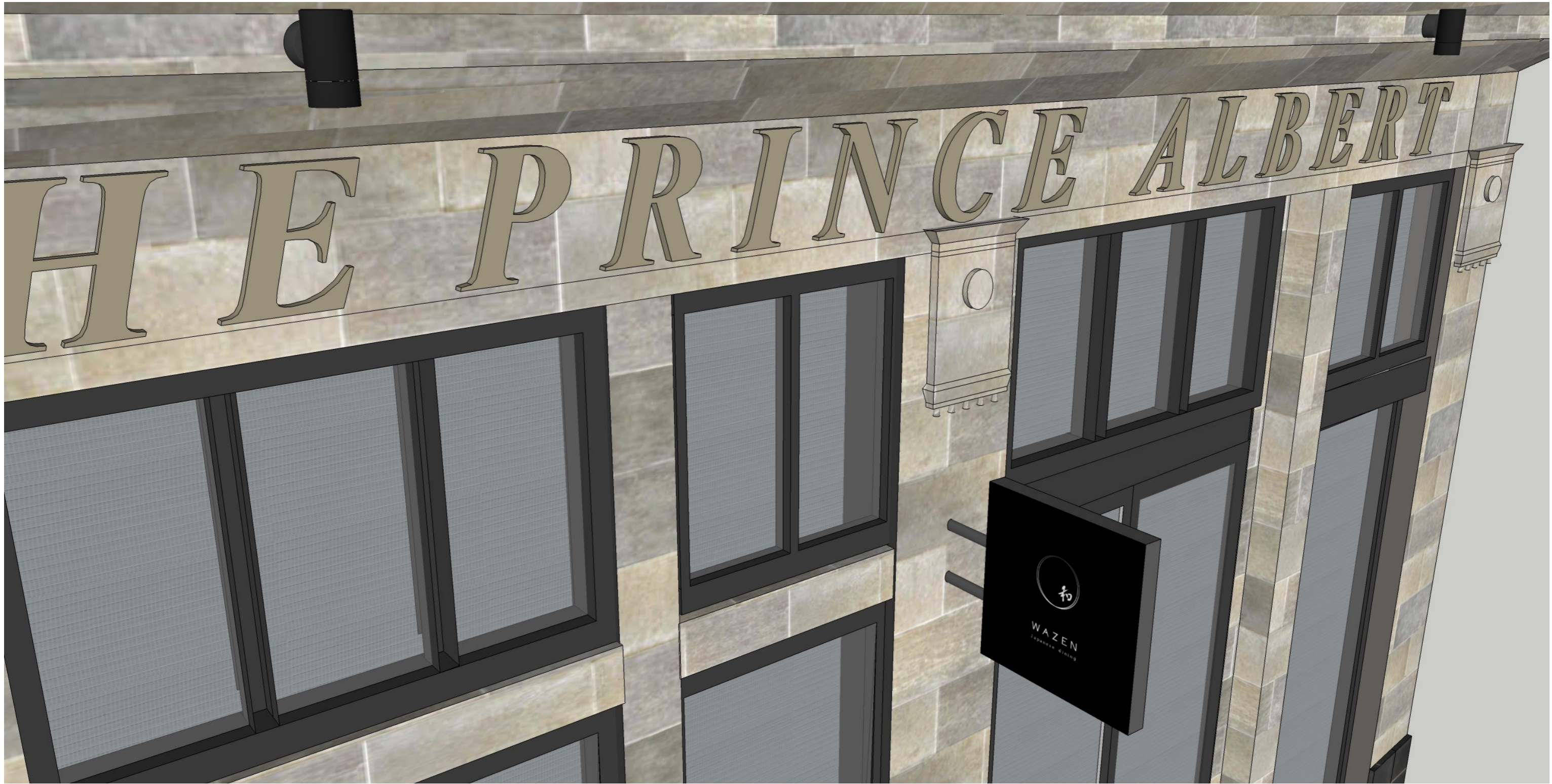
Proposed side signage on Kings Cross Road facade