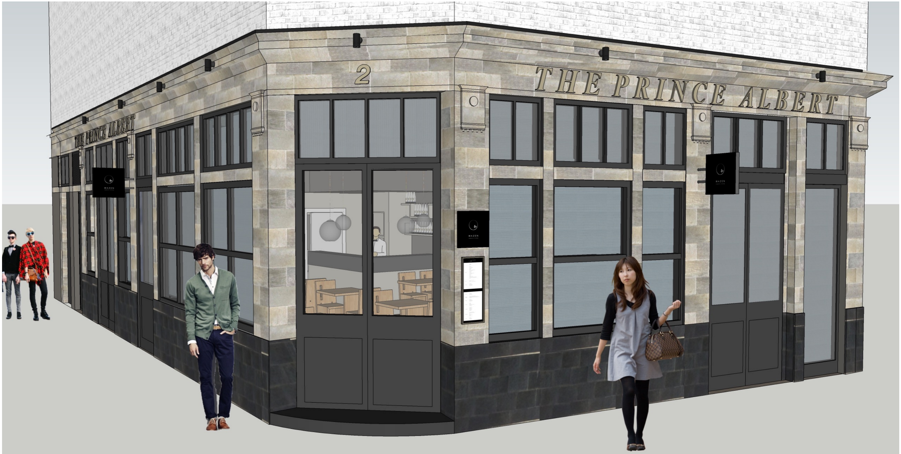
Proposed Shopfront with new signages