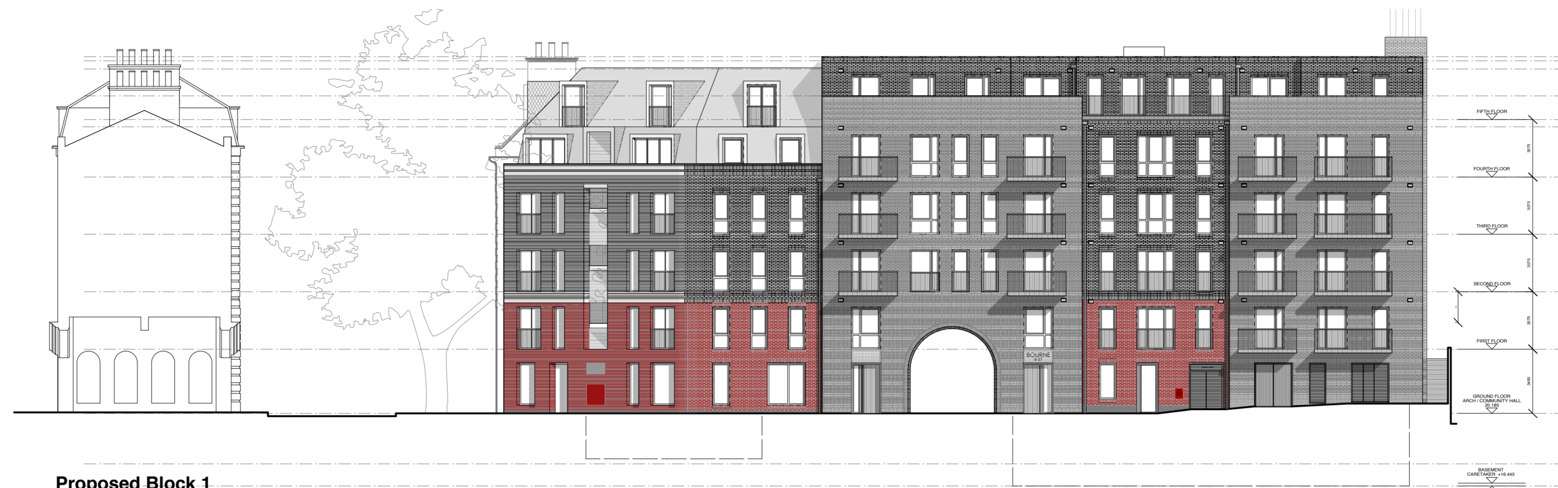
Proposed Block 1 Elevation C - 1:200@A1