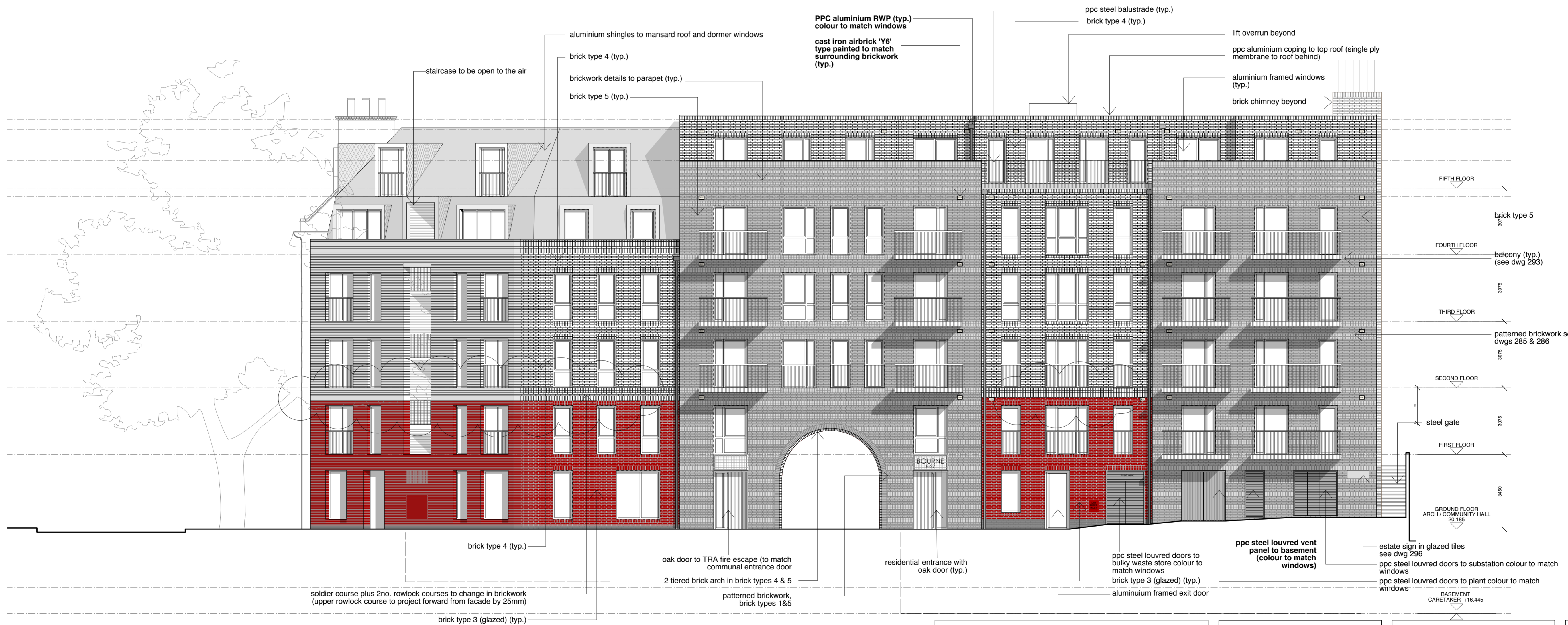
Proposed Block 1 Elevation C - 1:100 @A1