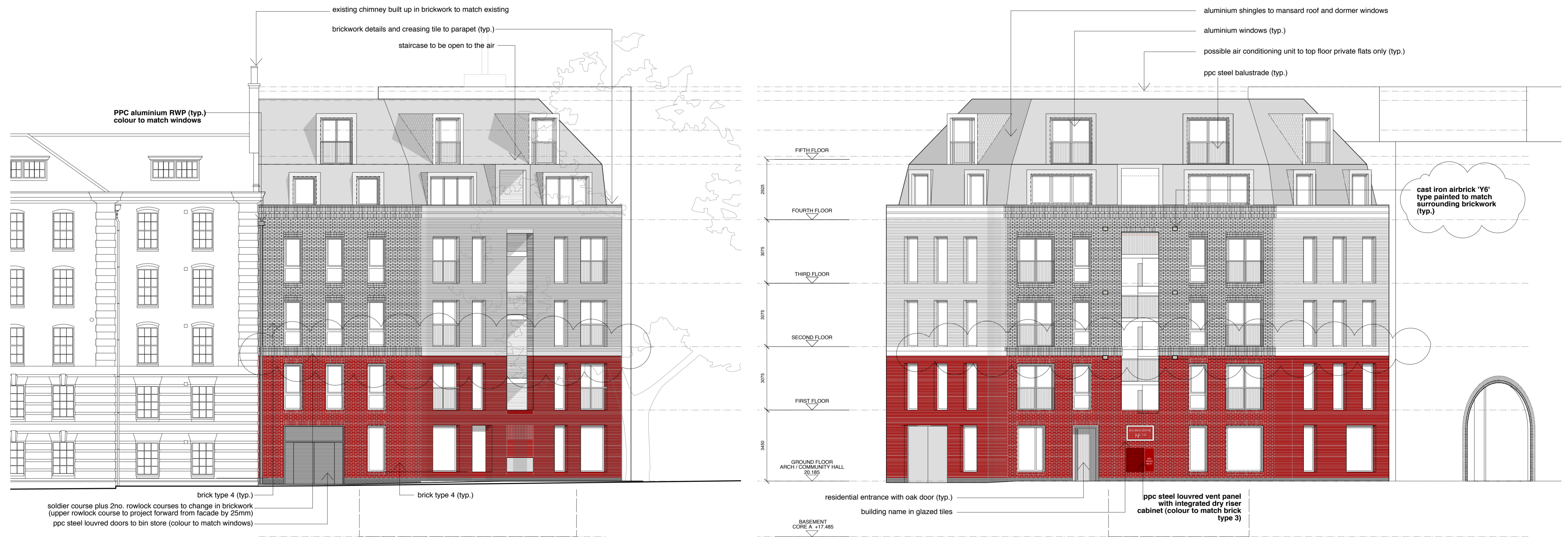
Proposed Block 1 Elevation A - 1:100 @A1