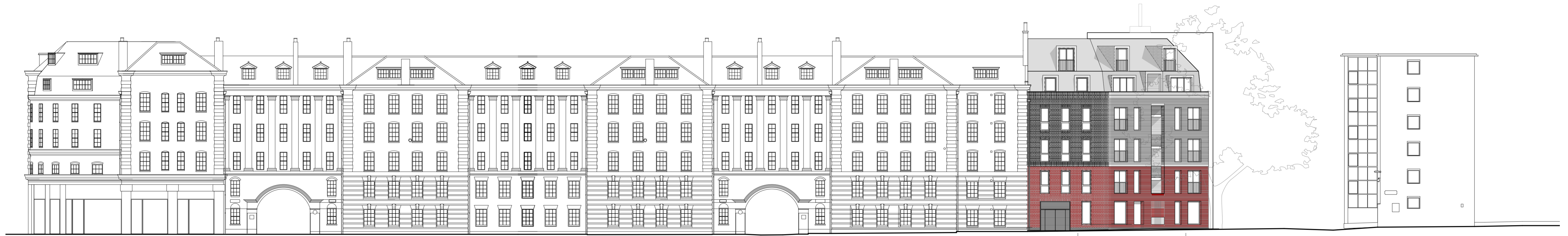
Proposed Block 1 Elevation A - 1:200@A1