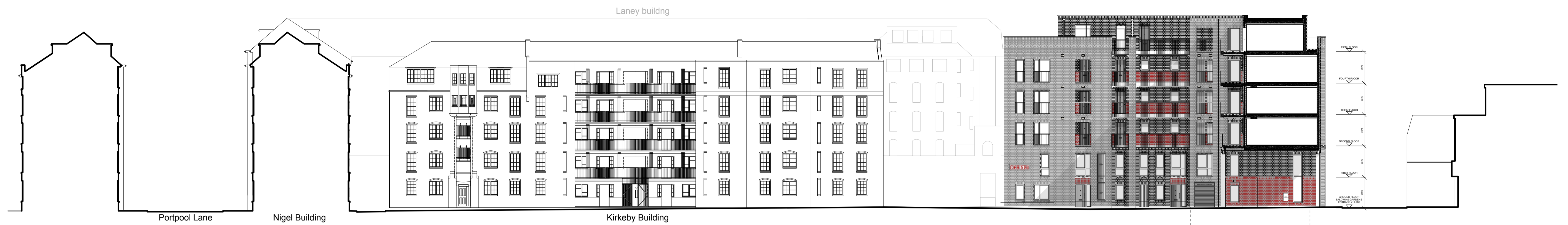
Proposed Block 2 Section 8 - 1:200@A1