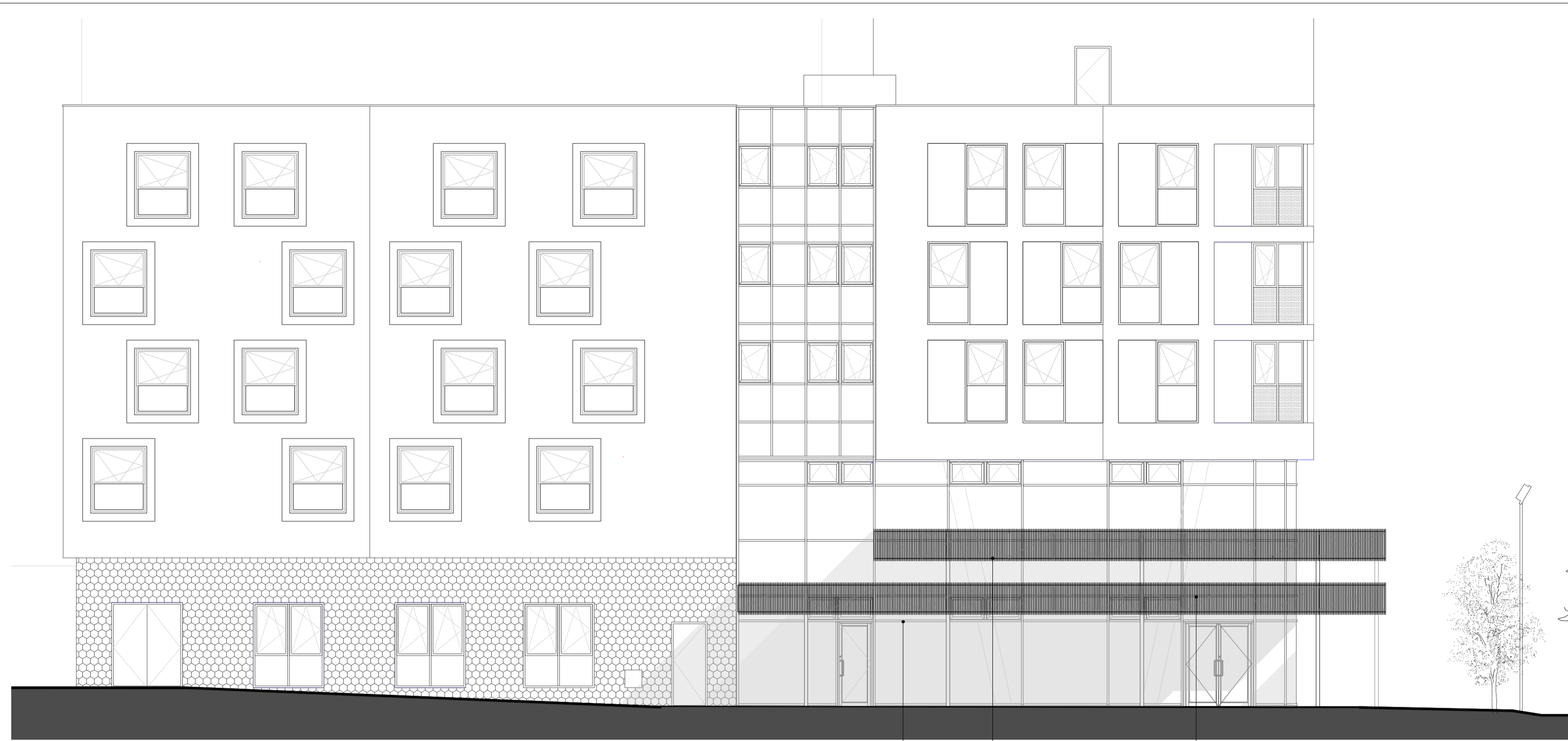
1 EXTERNAL ELEVATION AT 1:100

PPC Steel frame External Grade Fabric Canopy covering, laid to falls, flush with underside of frame Expanded metal mesh cladding