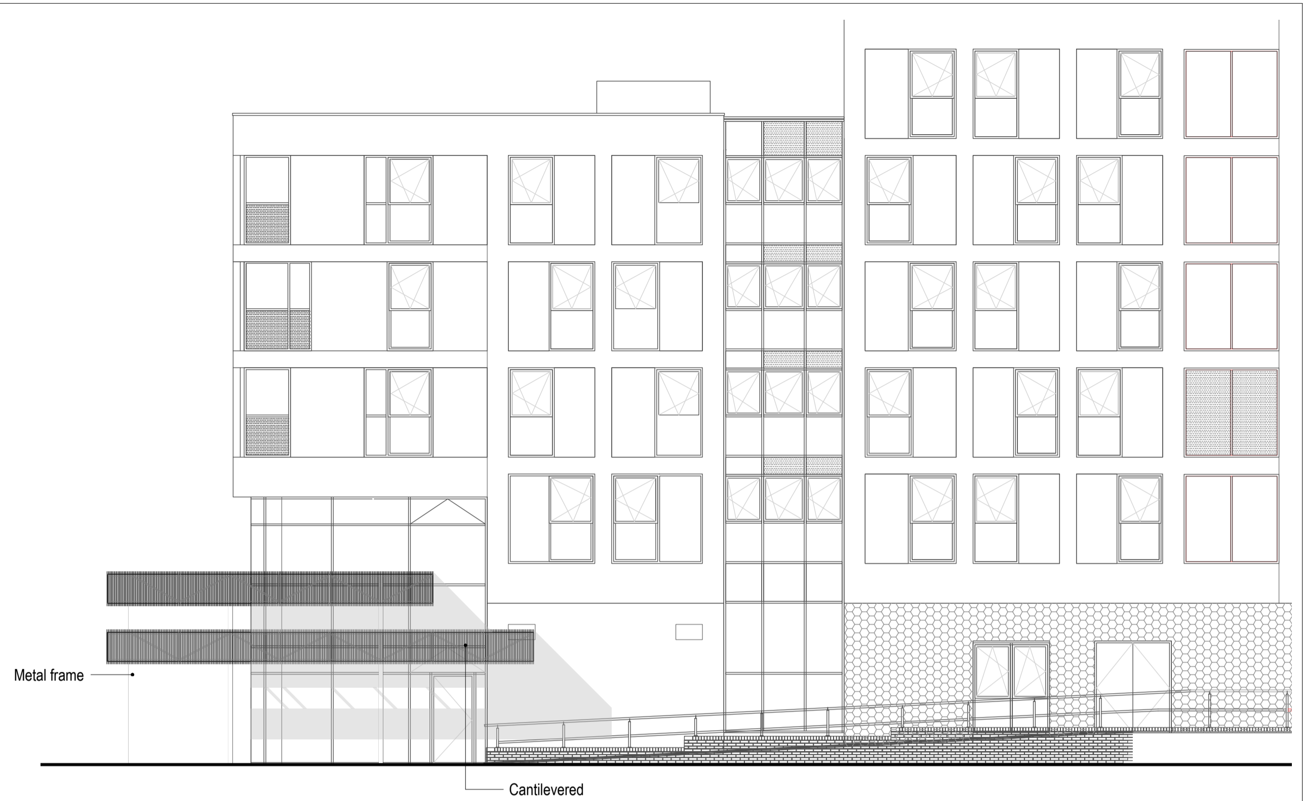
2 EXTERNAL ELEVATION AT 1:100

PPC Steel frame External Grade Fabric Canopy covering, laid to falls, flush with underside of frame Expanded metal mesh cladding