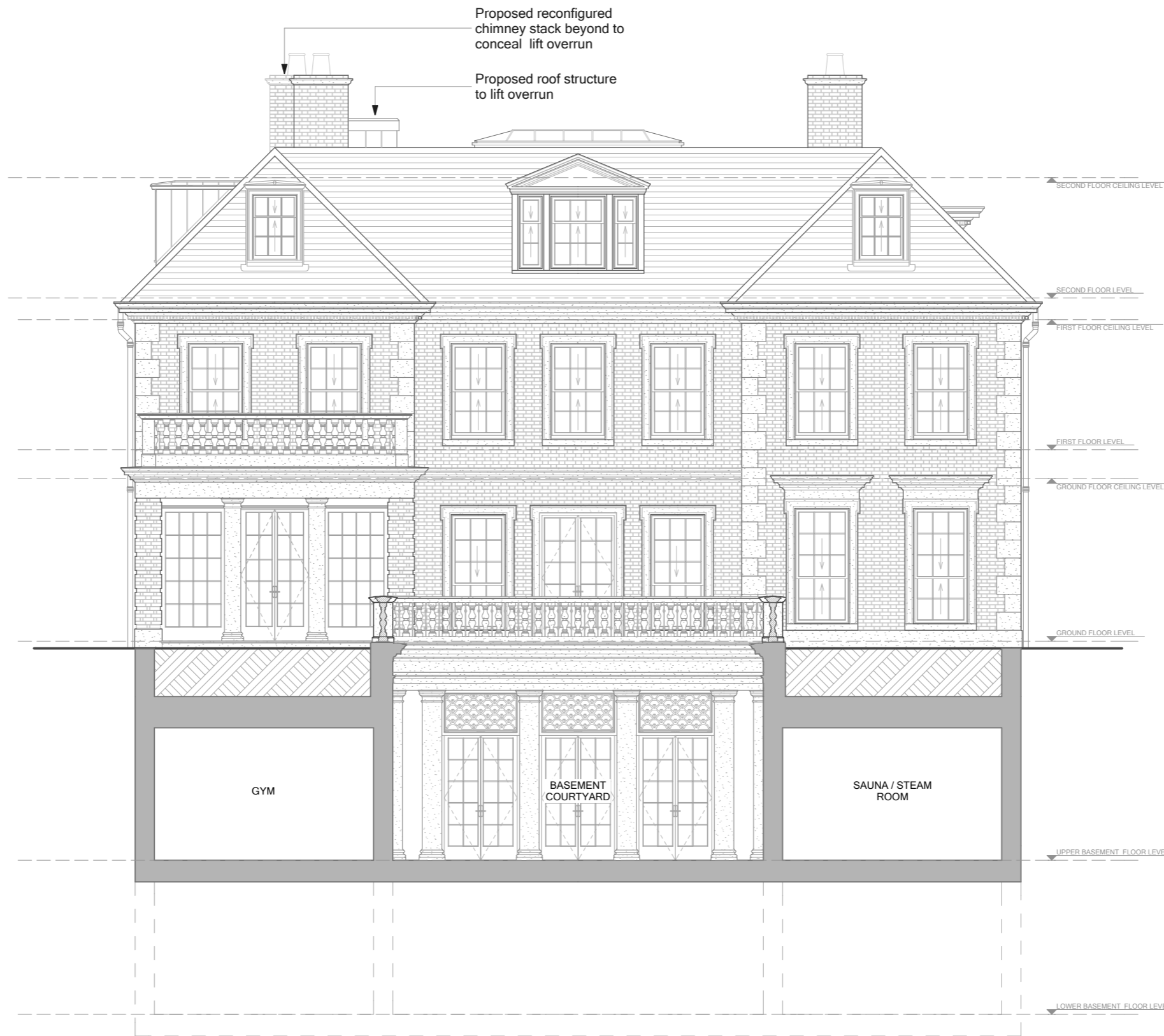
Proposed Southwest (Rear) Elevation