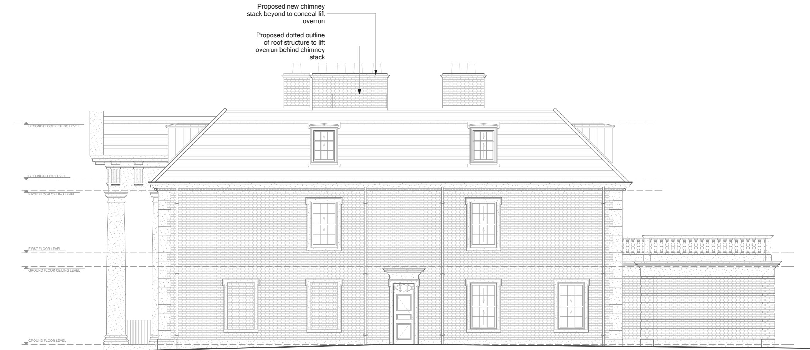
Proposed Northwest (Side) Elevation