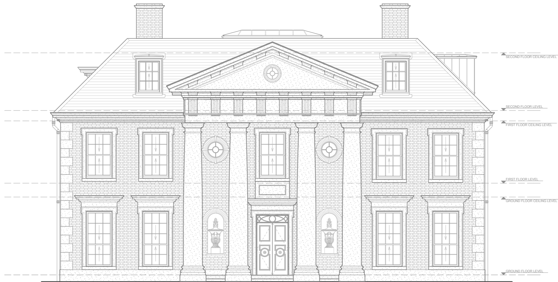
Proposed Northeast (Front) Elevation