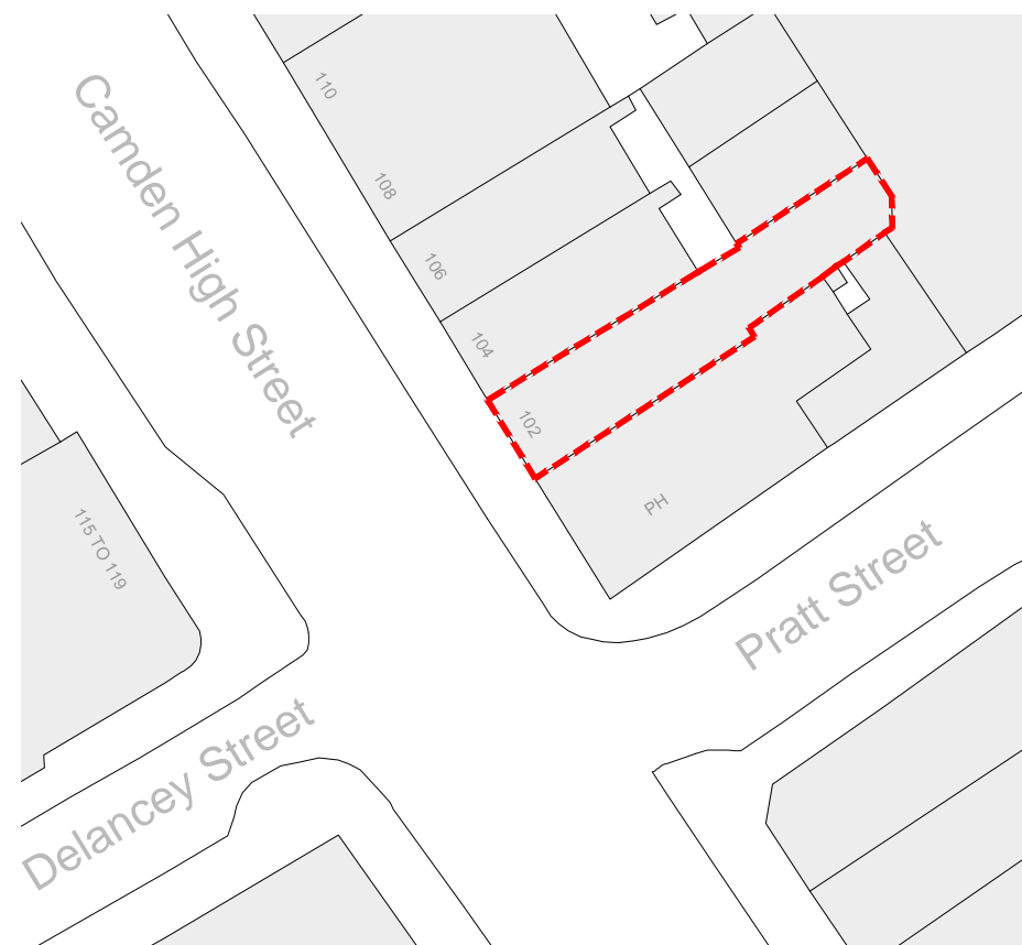
SITE LOCATION PLAN SCALE 1:500