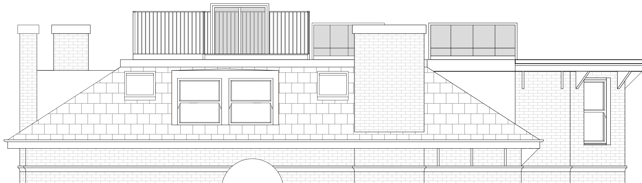
Left side elevation - As Proposed