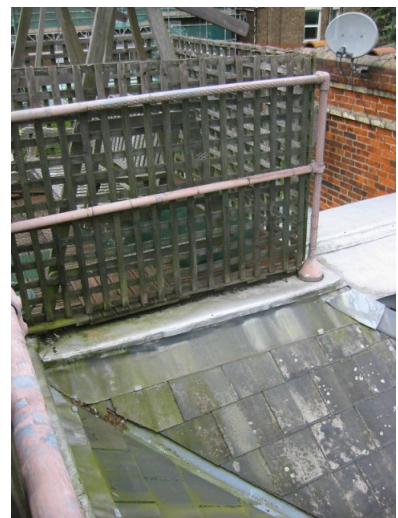
Existing railing - Key Clamp handrail, painted pink, with guarding panels of timber garden trellis

Revisions A - 24.07.2015 Scaling note taken off B - 5.10.2015 Extra details added to drawing