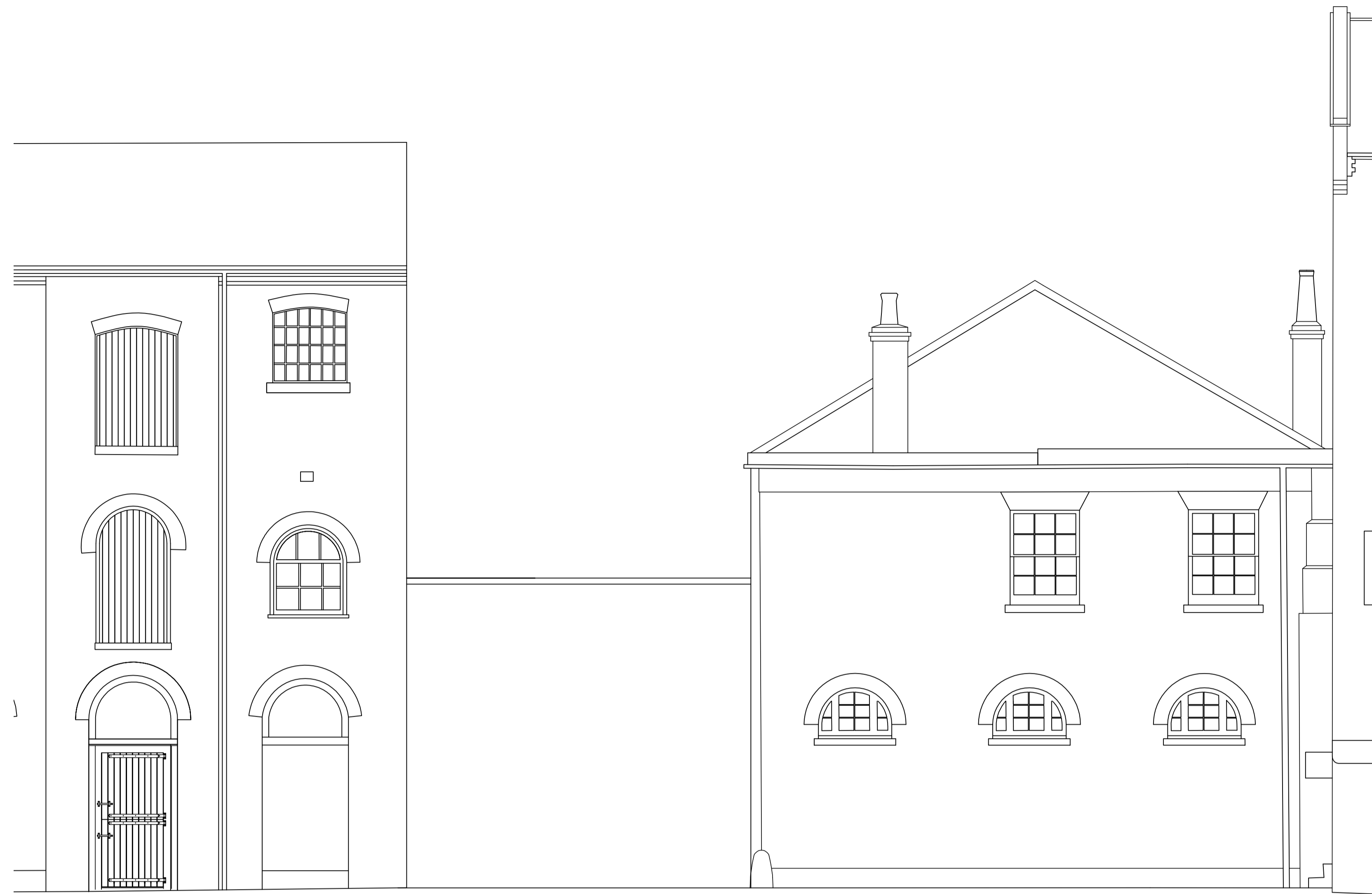
Existing North Elevation Scale 1:50