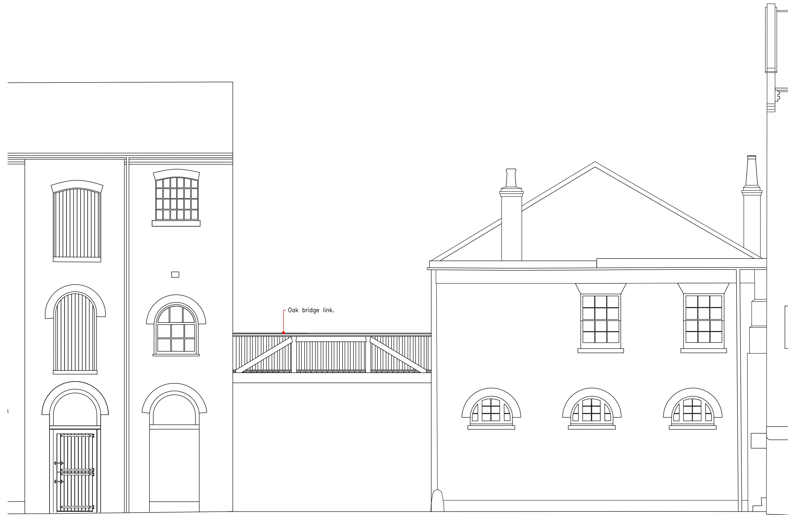
Proposed North Elevation Scale 1:50