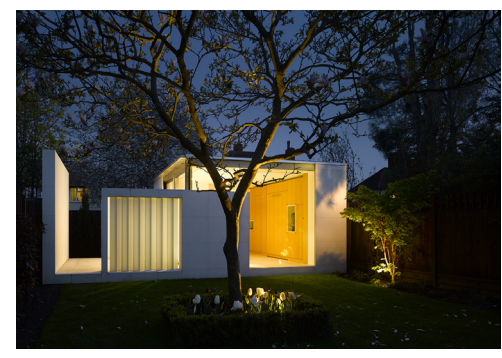
Lonsdale Road Pavilion