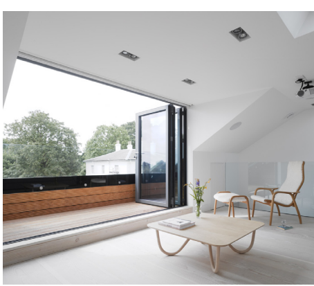
Work Sample 2:

Modern roof terrace to dormer and extension to lower floors to Englefield Road, Camden, London, N6