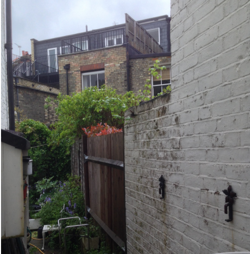
View of 47 Burrad Road in Context

Note the significantly different building lines on site on the rear elevations and numerous existing roof terraces.