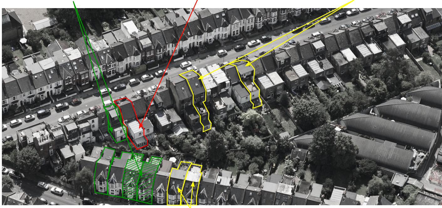
Properties on Ingham Road with existing roof terraces

Properties on Burrard Road with existing roof terraces