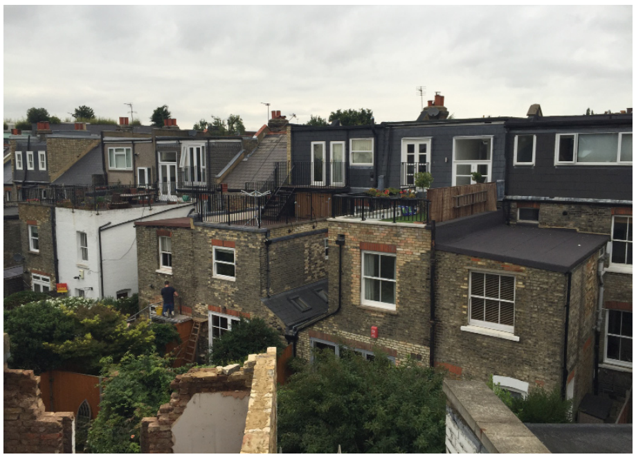
Images of existing roof terraces on Ingham Road visible from the garden of No. 47

Images of existing roof terraces on Burrard Road visible from the garden of No. 47. Burrard Road. Bottom right corner shows a roof terrace on the same terrace (assumed to be number 37 Burrard Road)