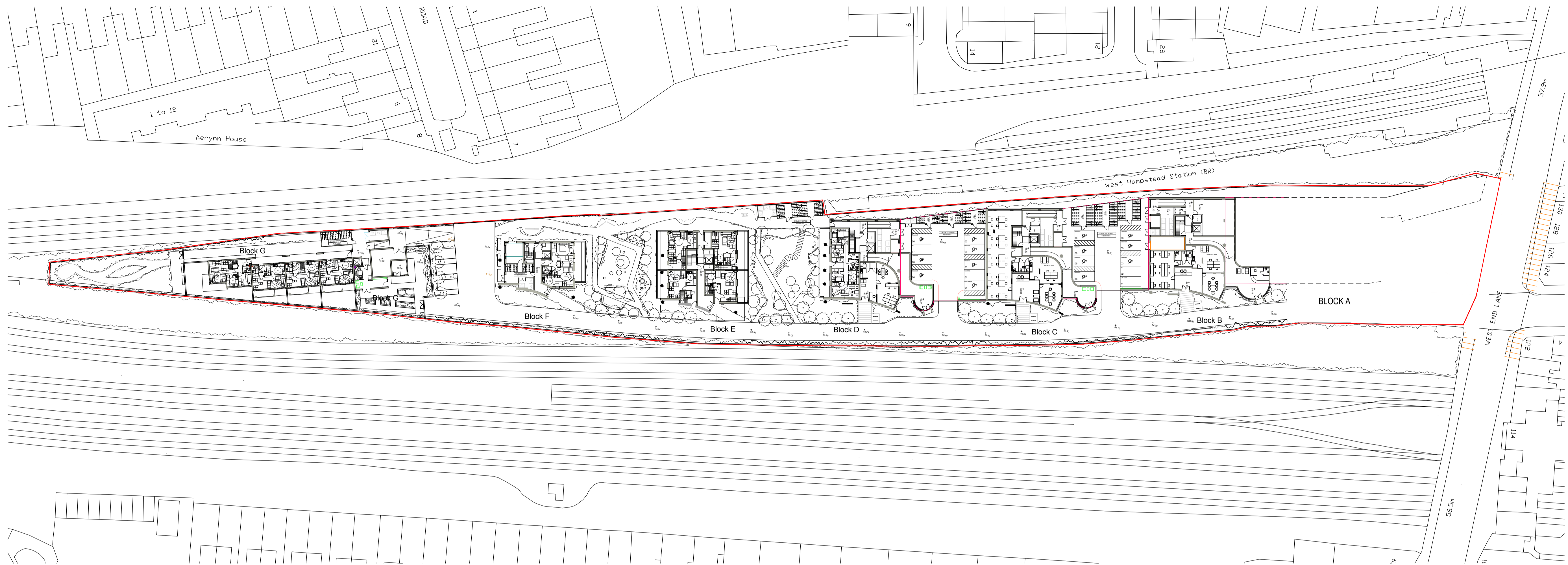
APPROVED SITE MASTERPLAN LOWER LEVEL