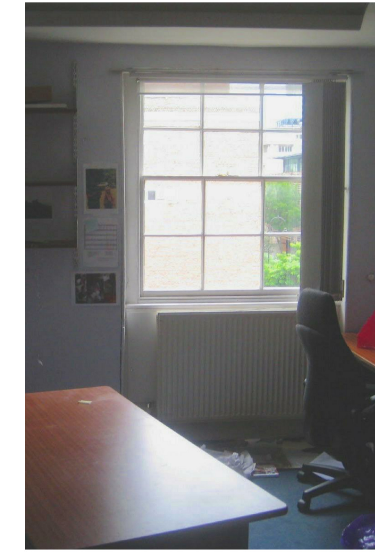
3. Internal View of Third Floor Front Room