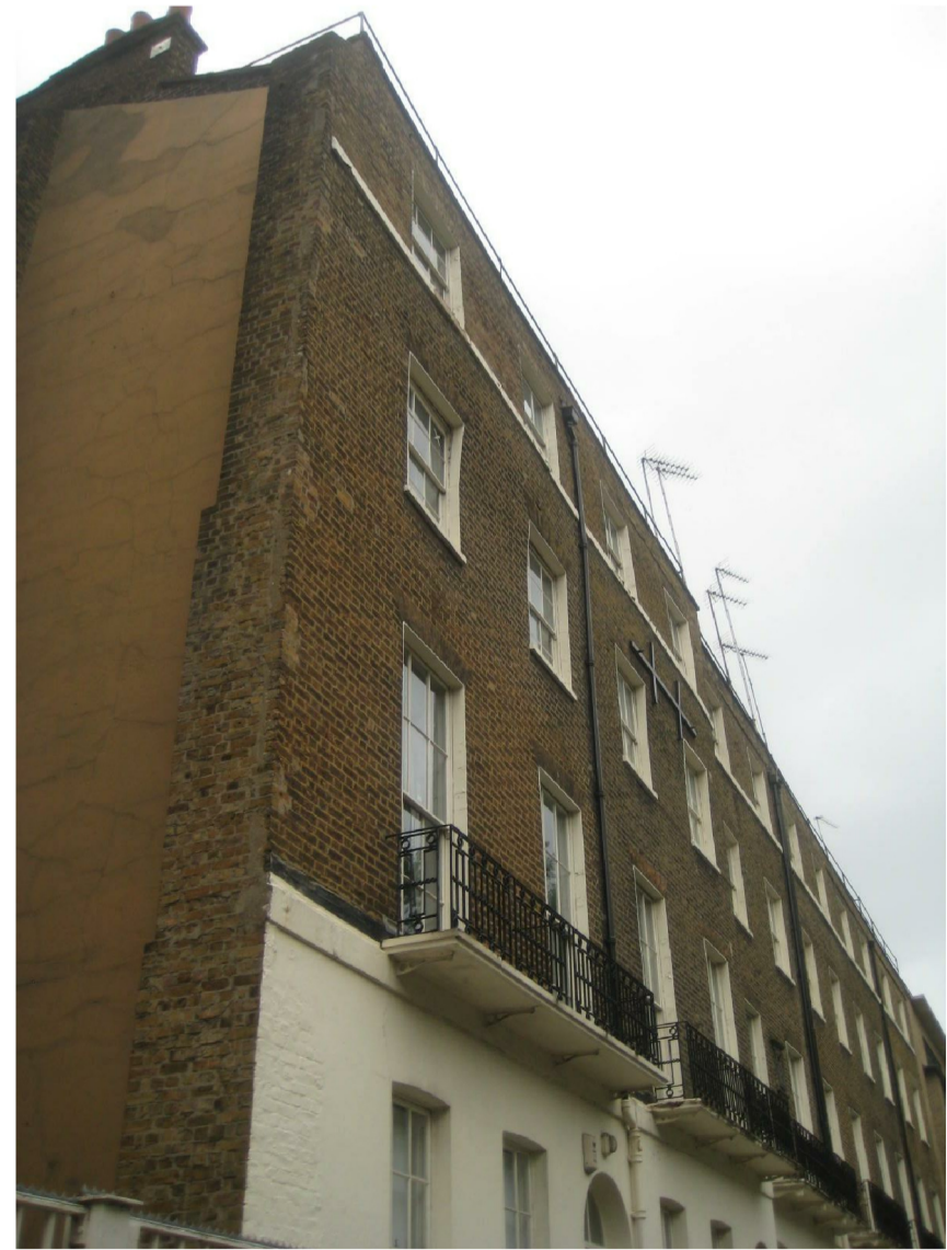
2. Front Facade