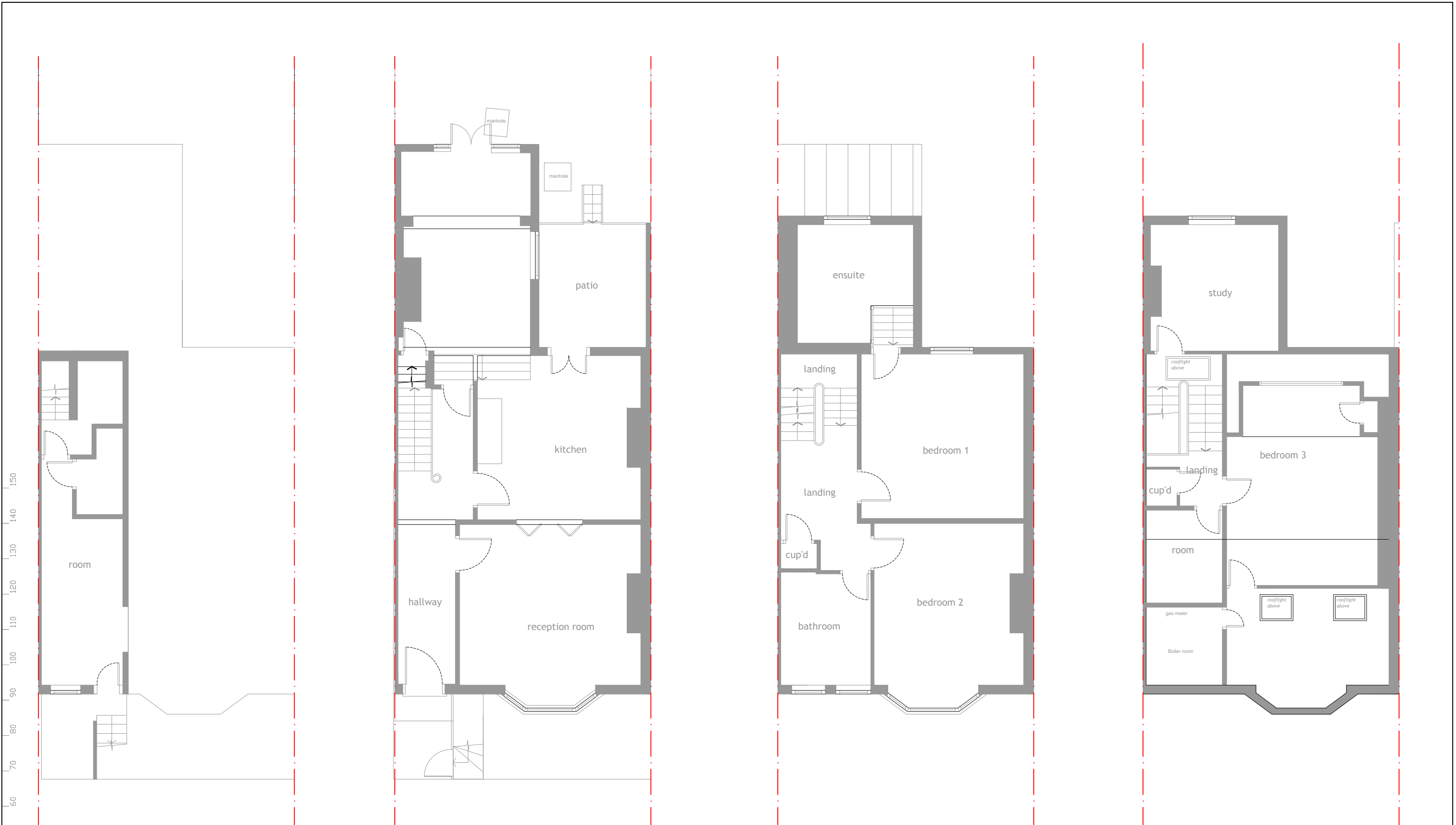
EXISTING BASEMENT PLAN 1:100