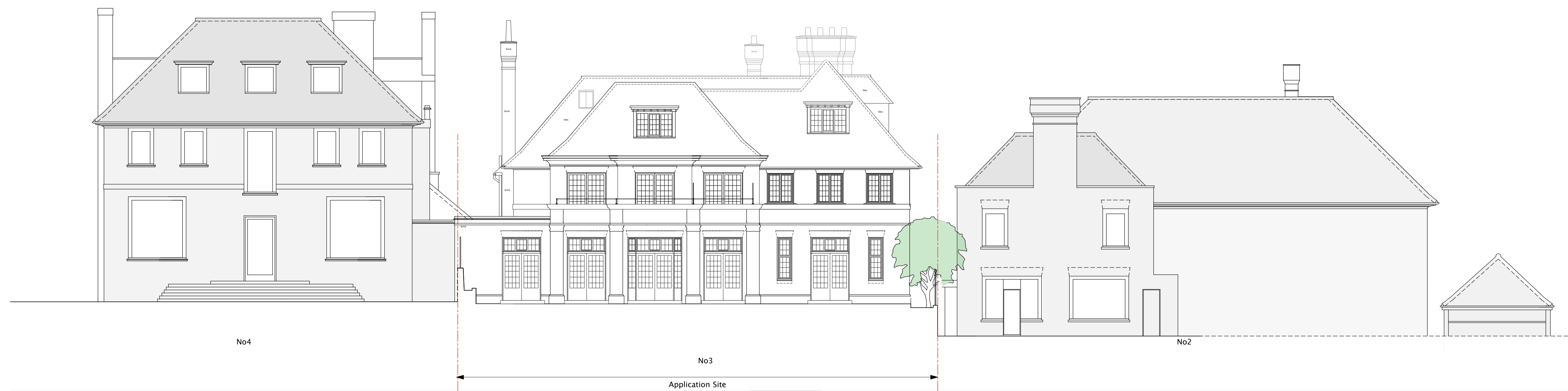
WEST ELEVATION (REAR)