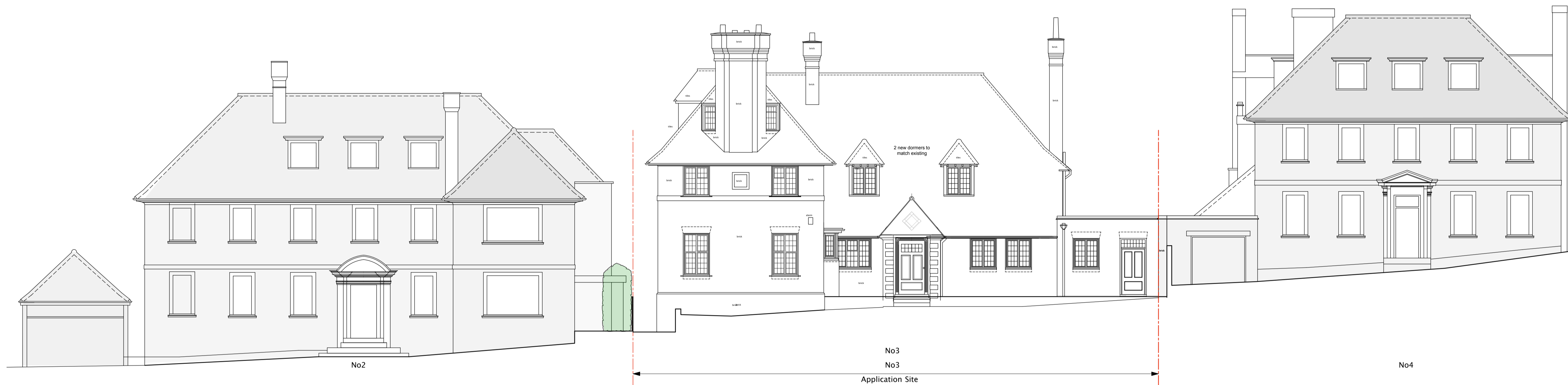
EAST ELEVATION (GREENAWAY GARDENS)