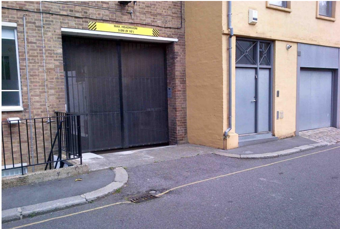
Photo 3: No.11 (on right) and adjoining commercial property. Note lightwell to lower ground floor (behind railings) and steep ramp down from vehicle access.