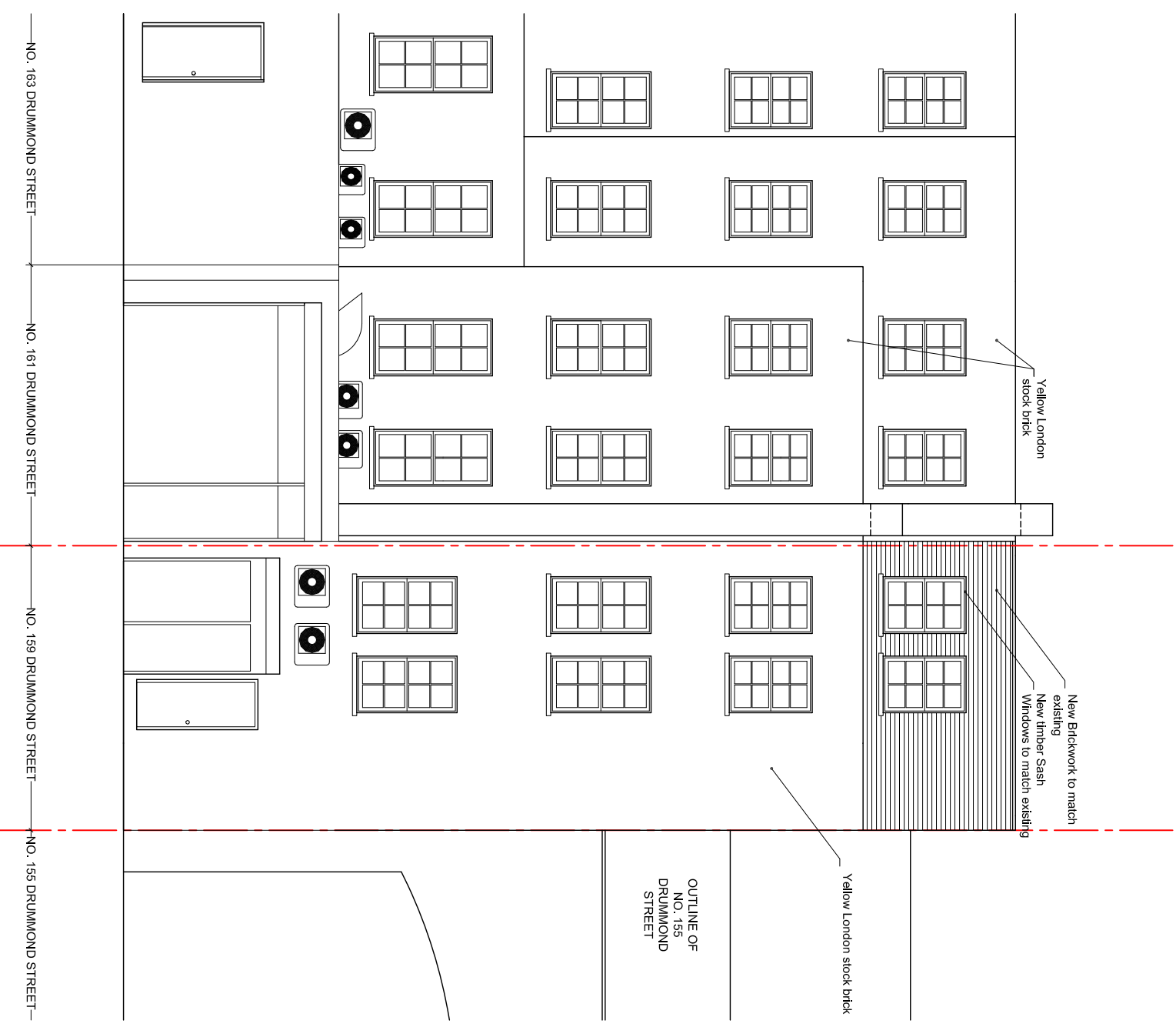
REAR ELEVATION PROPOSED scale 1:100

JUB studio 122 Church Walk, London, UK, N16 5DW www.jubstudio.com