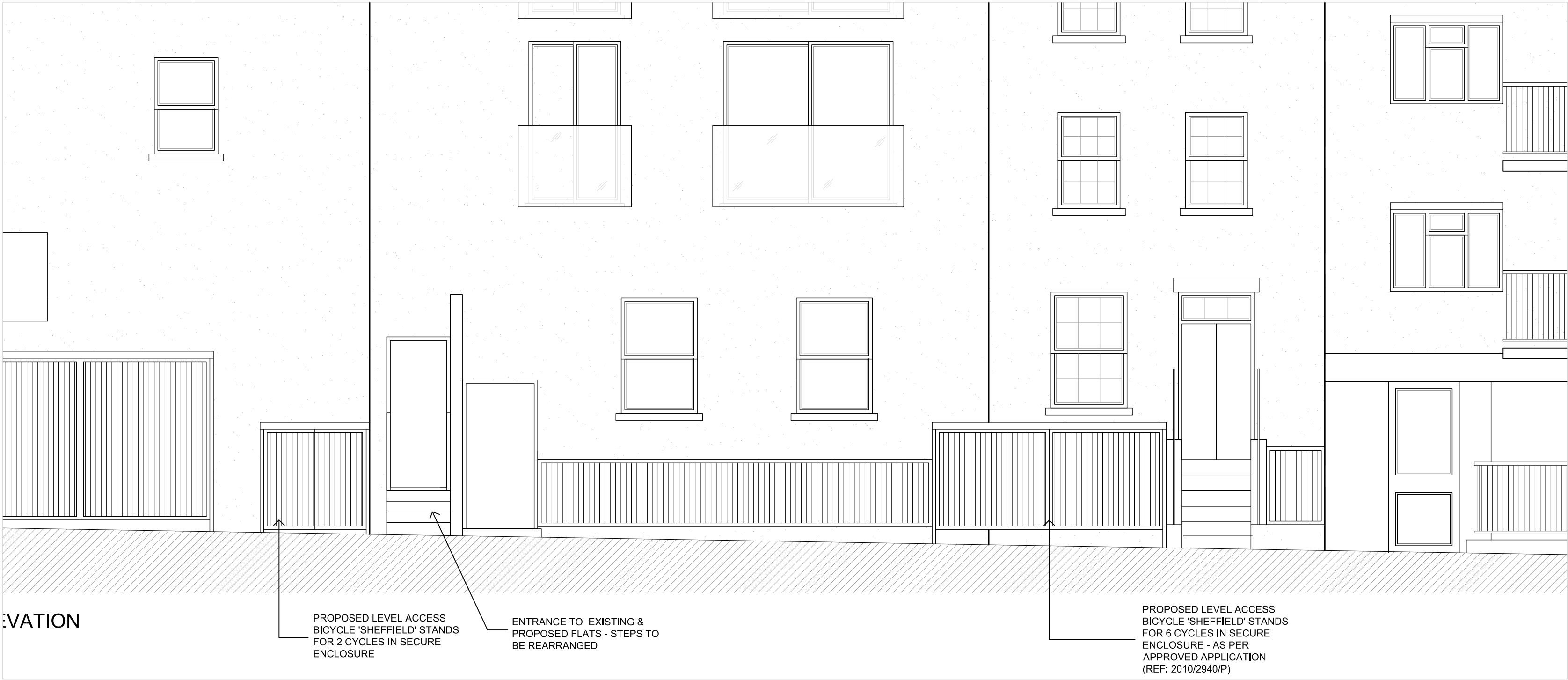
PROPOSED ELEVATION - CYCLE PARKING SCALE 1:50