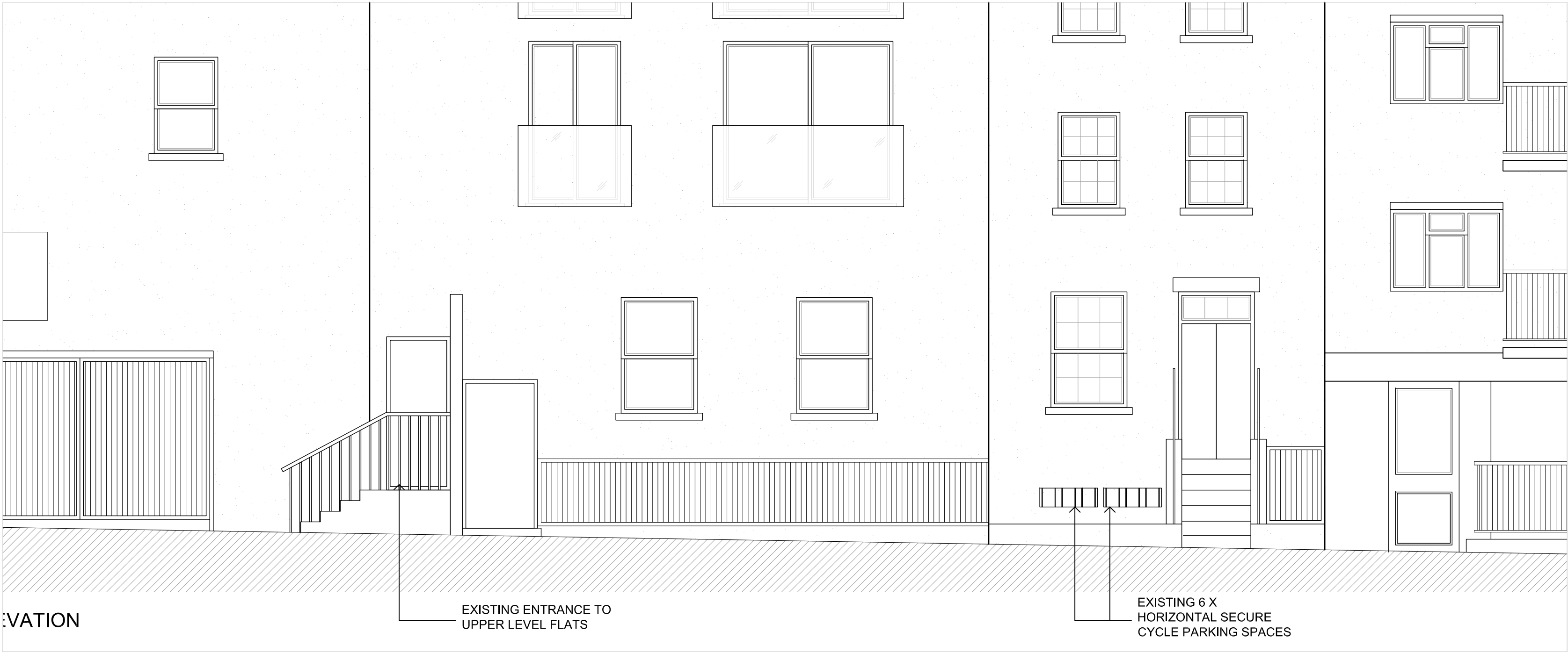
EXISTING ELEVATION - CYCLE PARKING SCALE 1:50