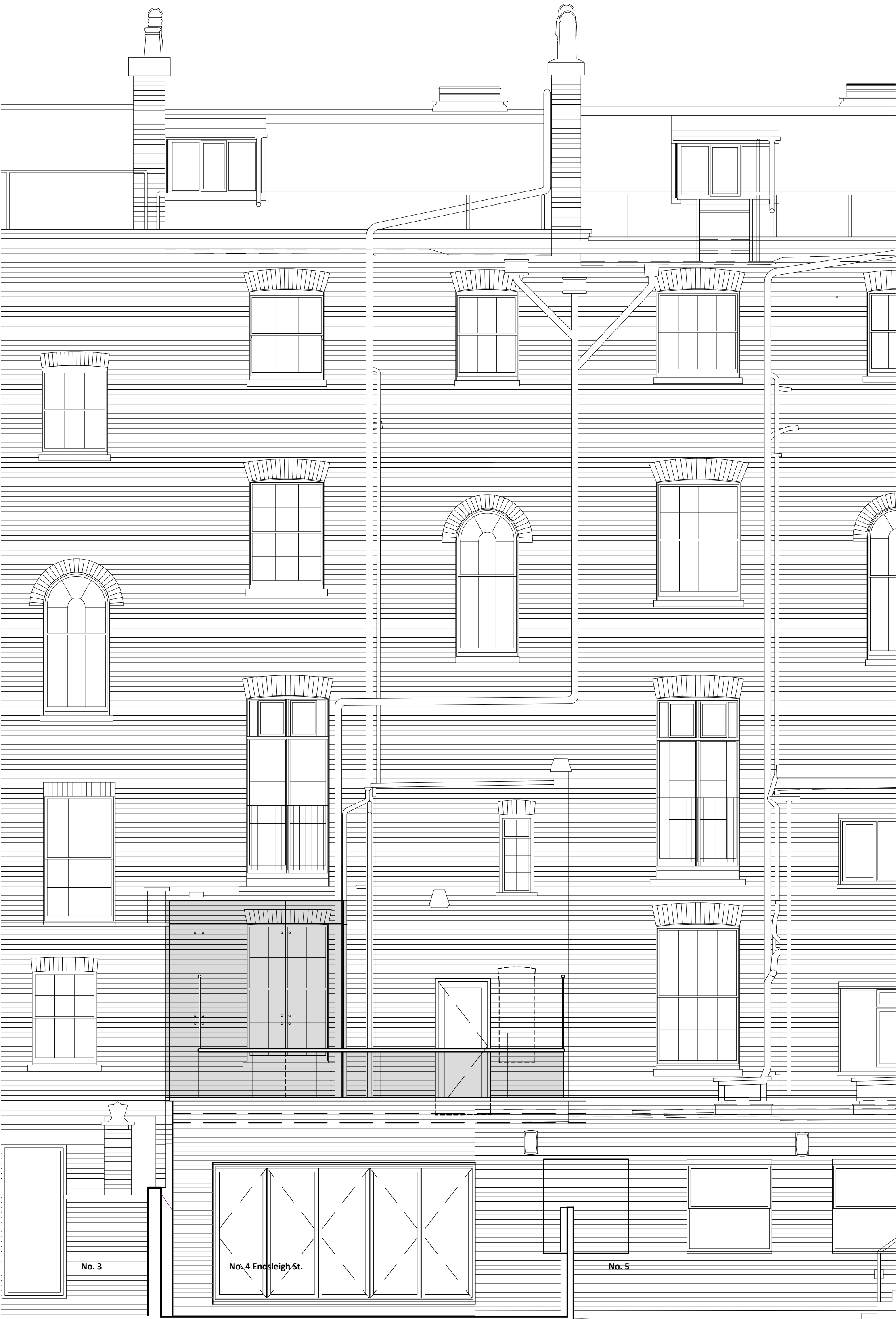
Roof Terrace Elevation

Notes: © Rio Architects Ltd. 2015. This drawing is copyright and must not be reproduced or disclosed to third parties without the prior written consent of Rio Architects Ltd. Do not scale this drawing. Responsibility is not accepted by Rio Architects Ltd for errors made by others during the printing or scaling of this drawing. Use only written dimensions. It is the contractor's responsibility to verify all dimensions before commencing any work. Any discrepancies are to be notified in writing to Rio Architects Ltd immediately. This drawing is to be read in conjunction with all other relevant project drawings, specifications and schedules prepared by Rio Architects Ltd and any other relevant consultants, specialists or subcontractors. CDM notes are provided to assist the contractor in managing residual hazards identified during the design stage. Any such notes do not relieve the contractor of his duties and he must provide a safe system of work based on method statements, risk assessments etc.