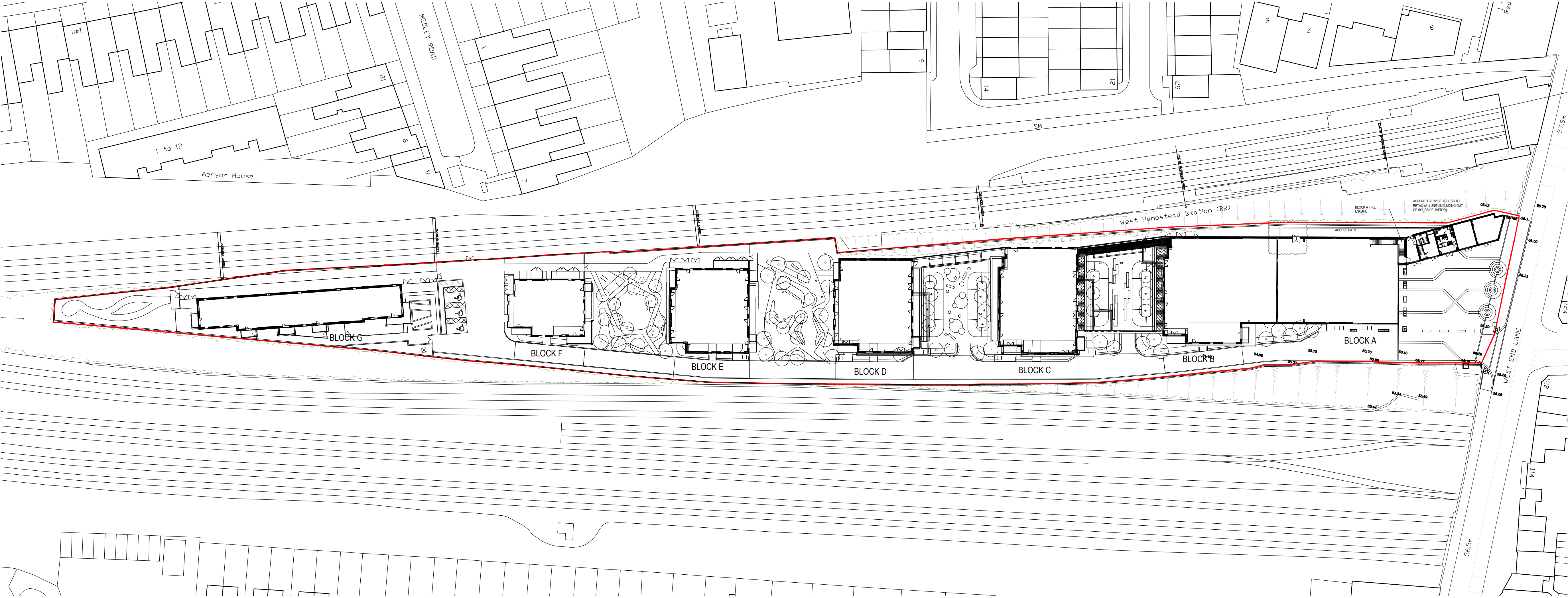
PROPOSED SITE MASTERPLAN STREET LEVEL

This drawing is copyright and shall not be reproduced nor used for any other purpose without the written permission of the Architects. This drawing must be read in conjunction with all other related drawing and documentation. It is the contractors responsibility to ensure full compliance with the Building Regulations. Do not scale from this drawing, use figured dimensions only. It is the contractors responsibility to check and verify all dimensions on site. Any discrepancies to be reported immediately. IF IN DOUBT ASK. Materials not in conformity with relevant British or European Standards/Codes of practice or materials known to be deleterious to health & safety must not be used or specified on this project.