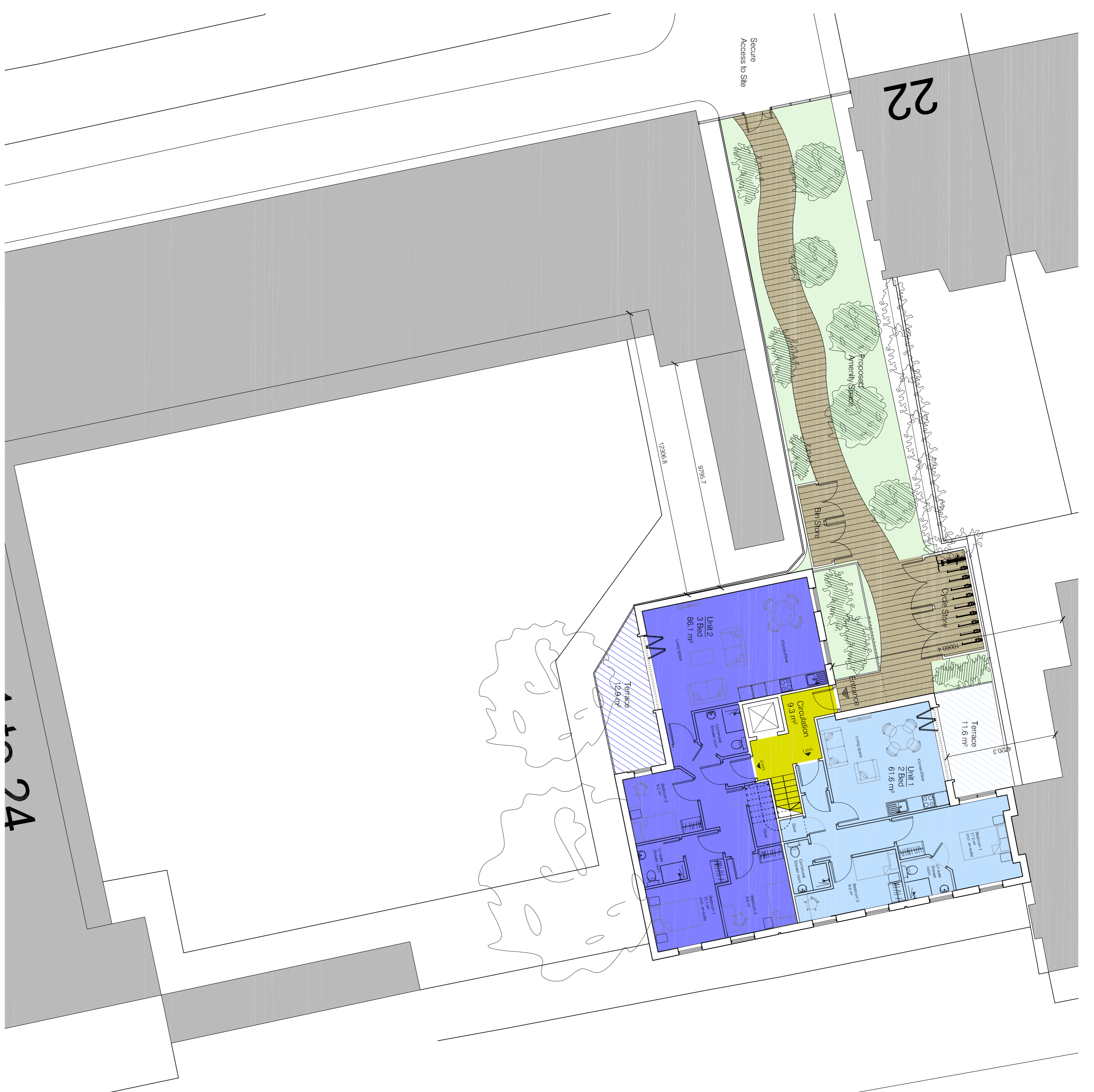
Site Plan / Ground Floor Scale 1:100