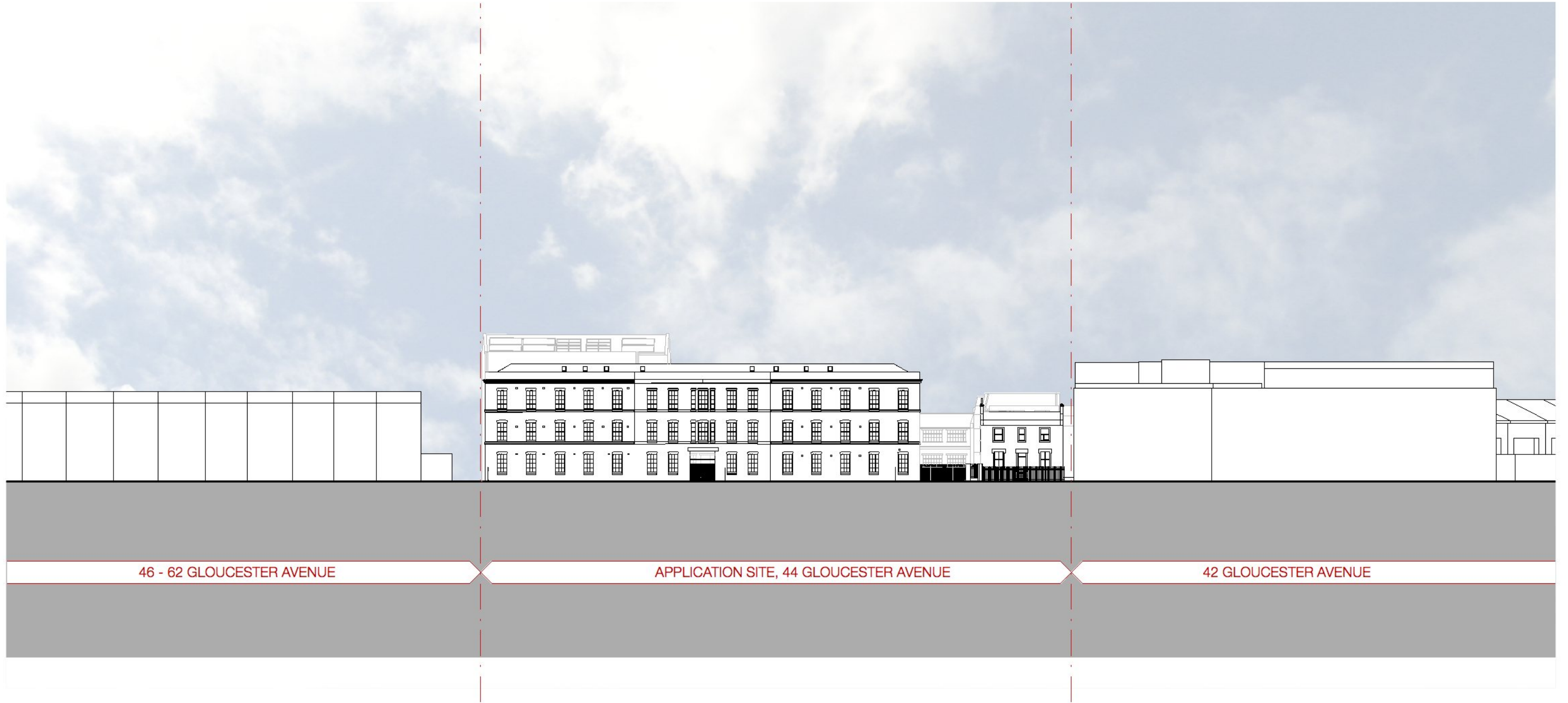
A Proposed Gloucester Avenue Elevation GE.04 1:250 @A1 1:500 @A3