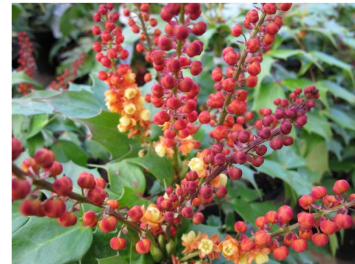
Mahonia nitens 'Cabaret'