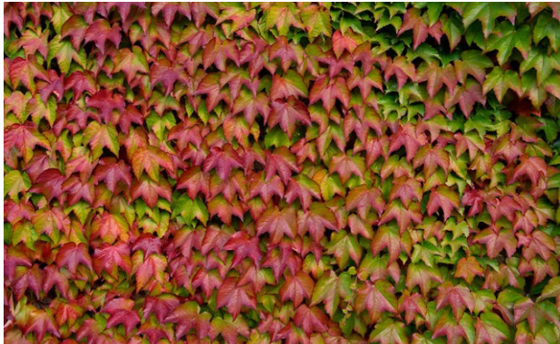
Parthenocissus tricuspidata 'Veitchi'