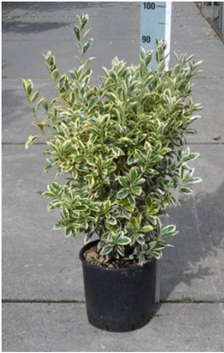
Euonymus Japonicus 'Bravo'