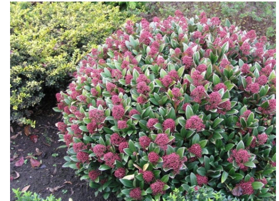
Skimmia japonica 'Rubella'