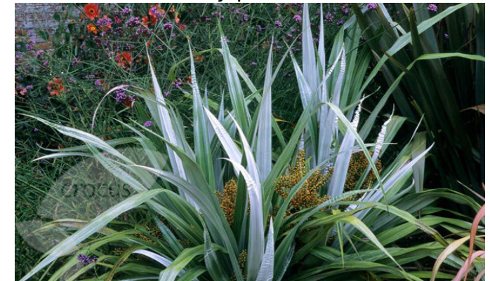
Astelia 'Silver Shadow'