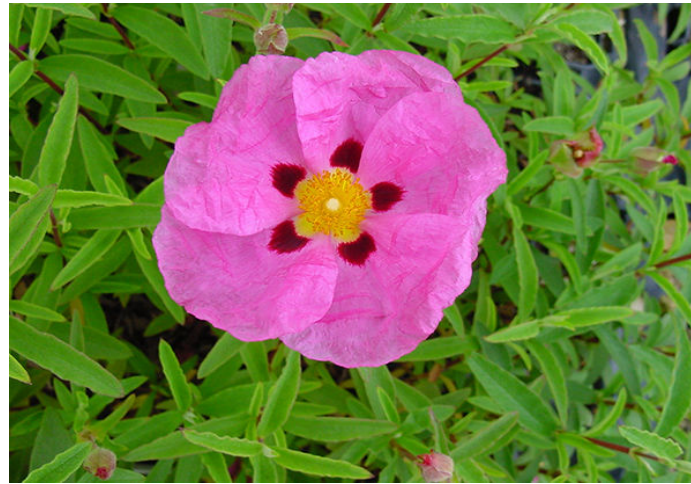
Cistus × purpureus