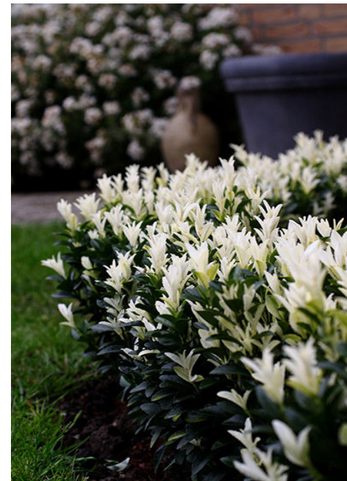
Euonymus japonicus 'Paloma Blanca'

Plant palette for party wall planters on roof