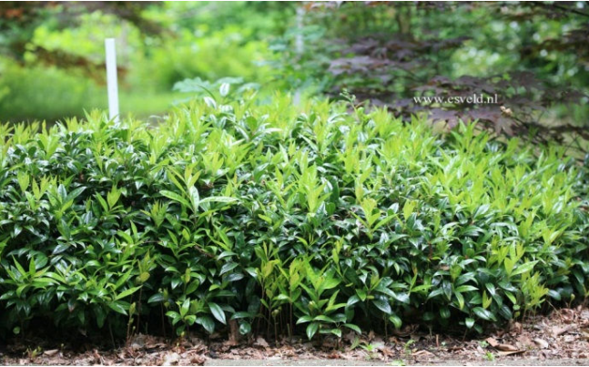
Sarcococca hookeriana humilis