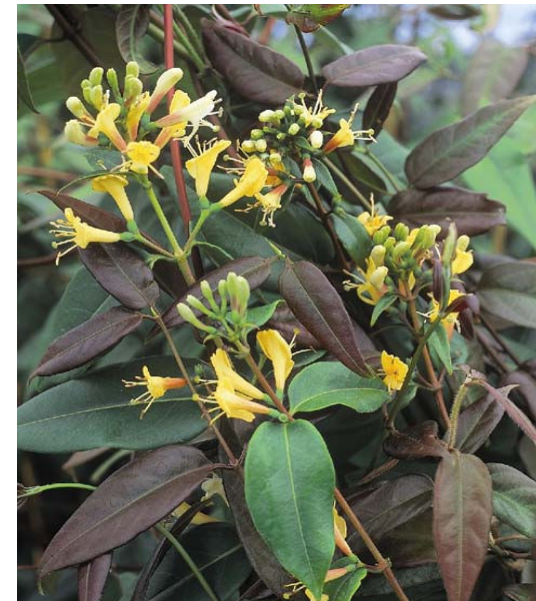
Lonicera henryi 'Copper Beauty'