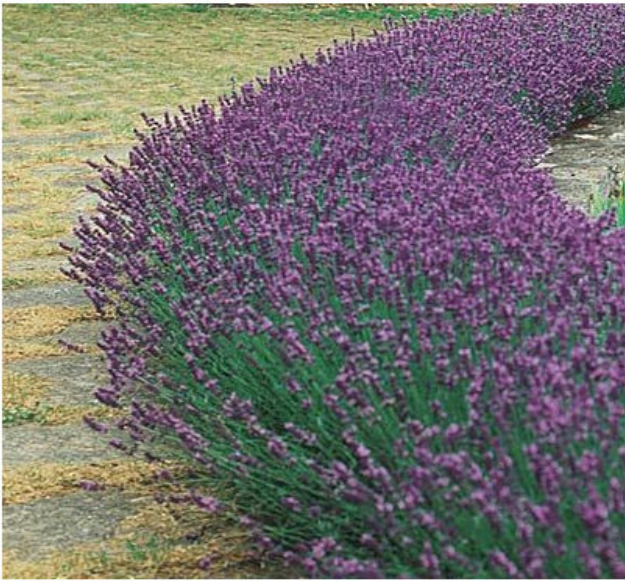
Lavandula angustifolia 'Munstead'