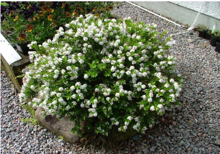
Hebe 'Wiri Mist'