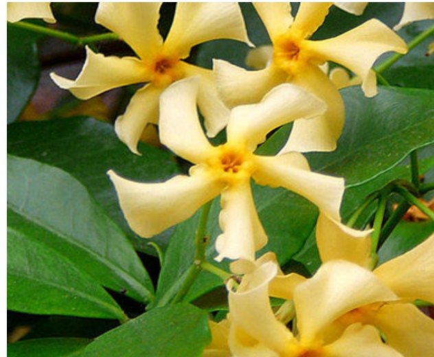
Lonicera japonica 'Halliana'