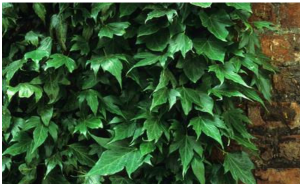
Hedera helix 'Green Ripple'

Plant palette for evergreen climbers in planters